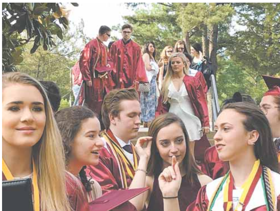
Students of the Oakton High School Class of 2018 gather on the steps outside George Mason University EagleBank Arena before their Commencement Exercises on June 8.