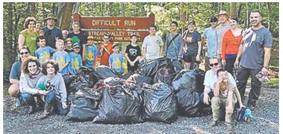
Area scouts and their families worked over two weekend work days to remove invasive plant garlic mustard from Difficult Run Stream Valley park in Oakton.

If you decide to remove garlic mustard from your property, be sure to bag it and dispose of it as garbage, not as yard waste. If disposed as yard waste, the seeds will eventually find their way back in the soil and aggressively take over park lands and people's yards. For more information go to https://www.fairfaxcounty.gov/parks/invasive-management-area