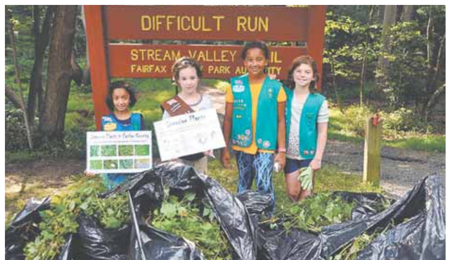
The scouts and their families pulled more than 20 large garbage bags of the invasive plant garlic mustard.