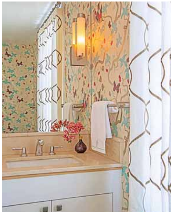
Adding new towels and shower curtain in light and airy colors, like those in the bathroom by Annie Elliott Interiors, can add a touch of summer to a bathroom.

separate crafts table for children is great or if space is an issue covering the kitchen table with a plastic tablecloth will work also," she said. "It also helpful to have a separate cart with plastic drawers or a small shelving unit with plastic bins to house craft items. I like plastic because it is washable."