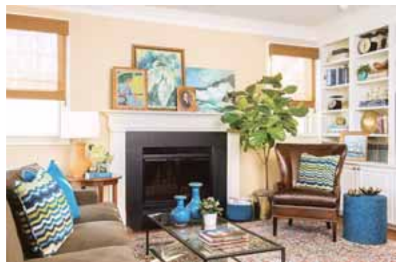
Adding throw pillows in light, airy colors like the one in the room by Annie Elliott Interiors, can make a space appear ready for summer.