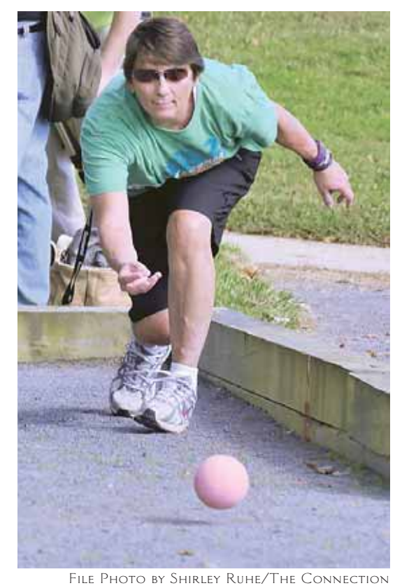
Northern Virginia Senior Olympics bocce competition