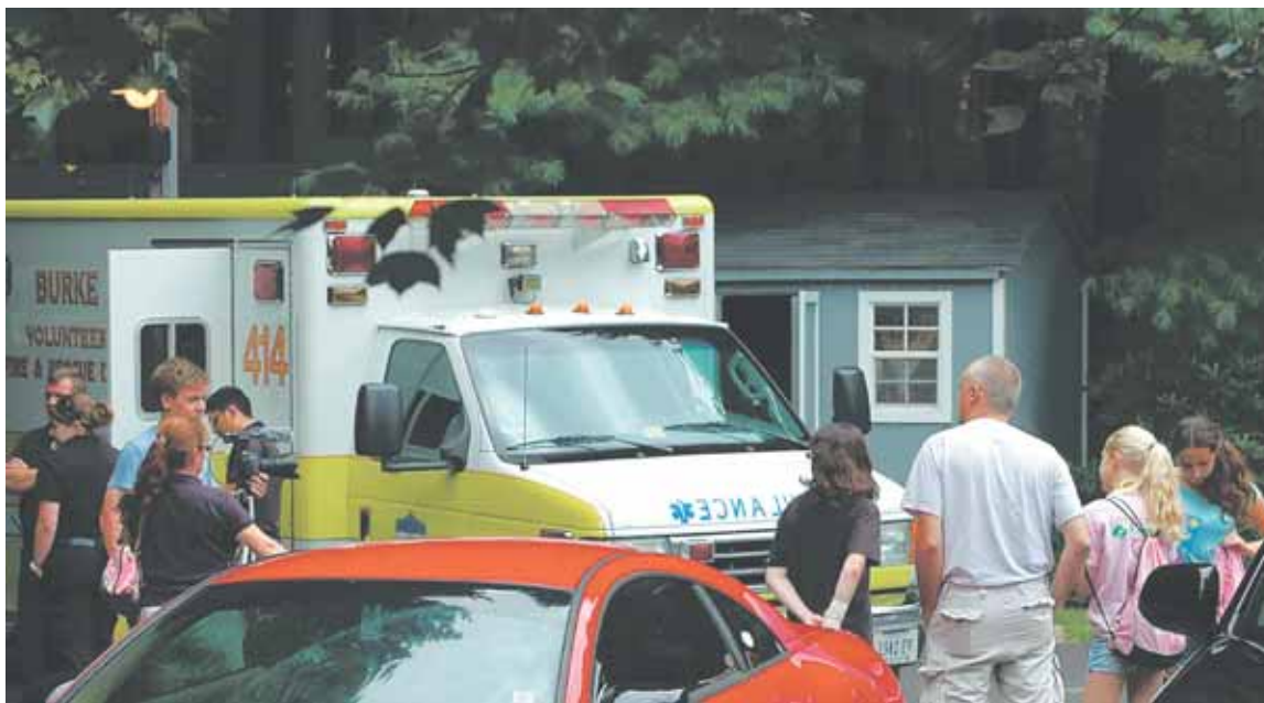
Fairfax Station Railroad Museum celebrates with First Responders Day.

Plant Clinic. Saturdays, 10:30 a.m. at the Chantilly Library, 4000 Stringfellow Road. A neighborhood plant clinic with horticultural tips, information, techniques, and advice.