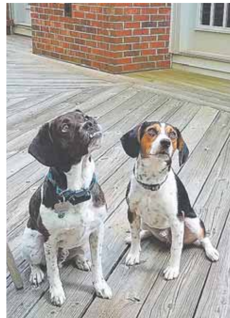
Beagle mix pups, Sully (age 3) and Zeke (age 2).