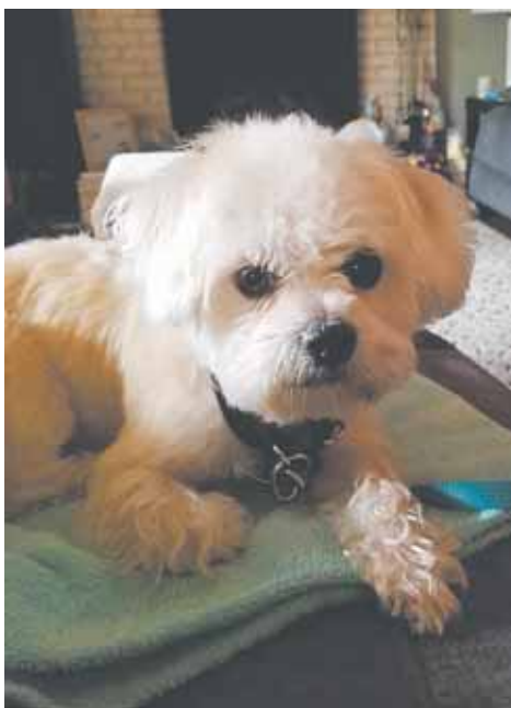
We rescued Bailey, our Maltipoo, in March.