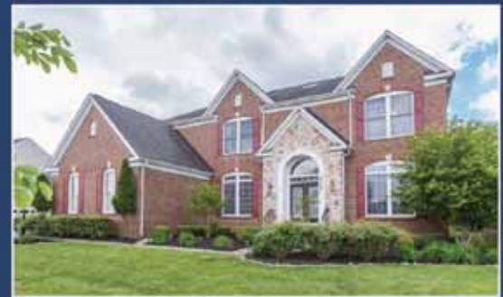
43985 Indian Fields Ct, Leesburg