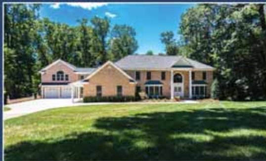
1070 Dougal Ct, Great Falls