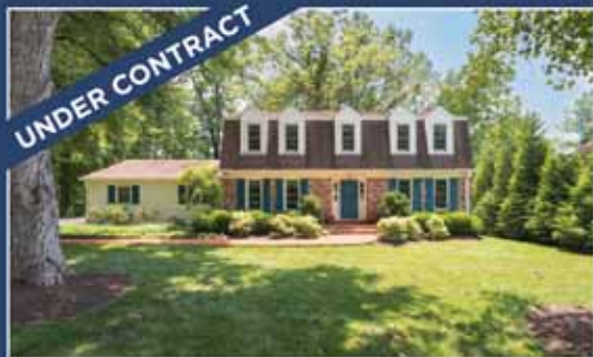
10207 Oxfordshire Rd, Great Falls

If you're buying or selling a home, think of this as a defining moment.