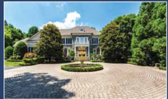
700 Strawfield Ln, Great Falls