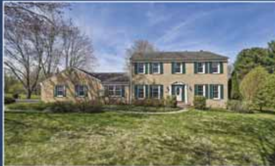
334 Club View Dr, Great Falls