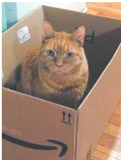
Mr. Giant of Great Falls

He is a 13 year-old tabby adopted from the animal shelter when he was 18 months old and is big as his name implies. Mr. Giant loves to spend time in the garden smelling the various herbs, vegetable plants and watching the birdhouses. He is a joy to have in the household.