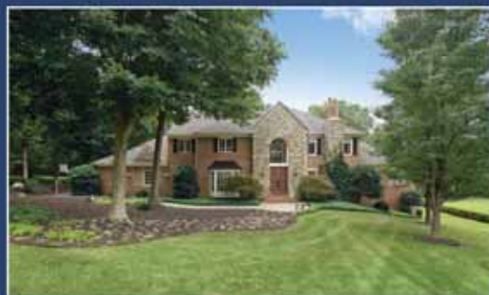
10859 Patowmack Dr, Great Falls