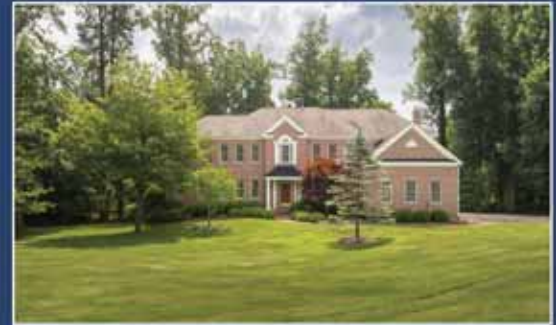
1495 Lily Loch Way, Great Falls