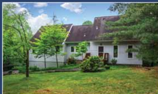
10929 Beach Mill Rd, Great Falls