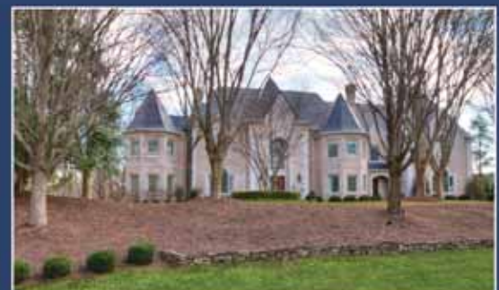
10010 High Hill Pl, Great Falls