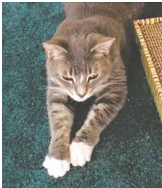
Waiting for the 'perfect family': Pippin.