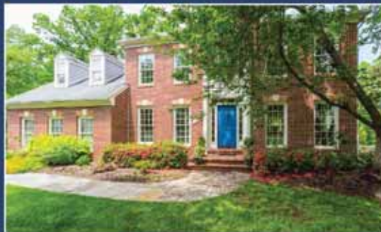
1237 Tottenham Ct, Reston