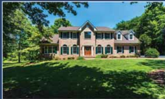
607 Kentland Dr, Great Falls