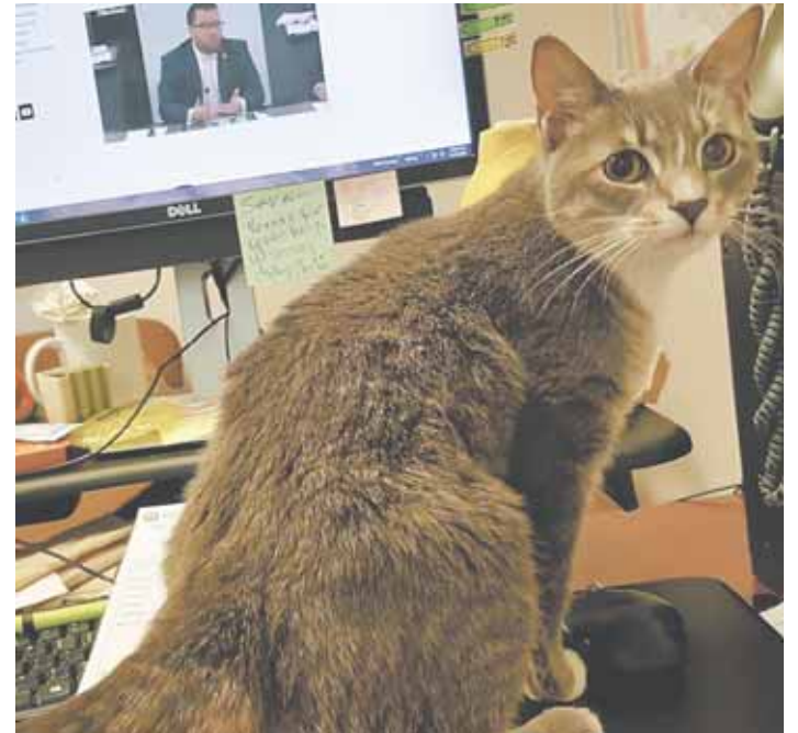
Pippin the climber

For more information about Canine Companions for Independence visit www.cci.org or call 1-800-572-BARK.