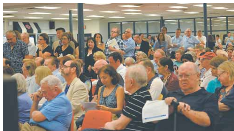
Having their say: Several hundred attended the public meeting to discuss the VDOT proposal to test closures on the Georgetown Pike ramp to I-495. Many came prepared to make comments and lined up to do so.