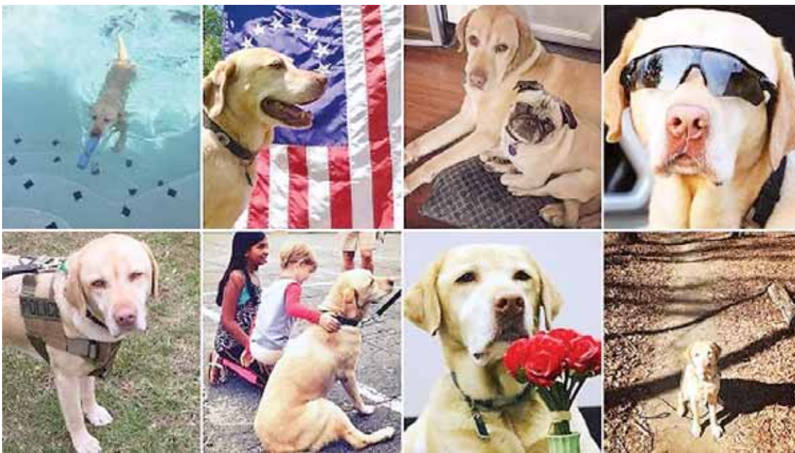
Get your picture taken with Moose.

Plant Clinic. Saturdays, 10:30 a.m. at the Chantilly Library, 4000 Stringfellow Road. A neighborhood plant clinic with horticultural tips, information, techniques, and advice.