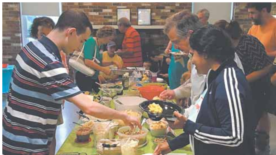
Greenbriar residents enjoy a potluck meal during their celebration.

the communities we serve and their residents."