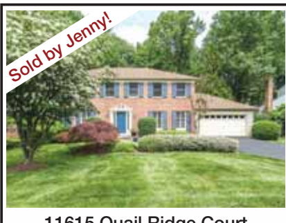
11615 Quail Ridge Court $750,000