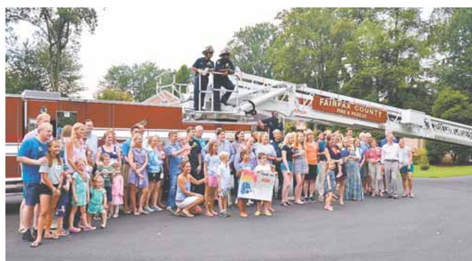
Residents of the Timberly neighborhood in McLean gathered to express their thanks to law enforcement and public safety personnel during the neighborhood's National Night Out celebration.