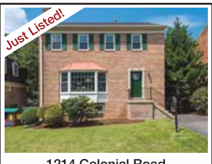
1214 Colonial Road McLean $925,000