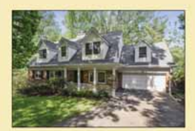
1425 Highwood Drive McLean, 22101 $1,295,000