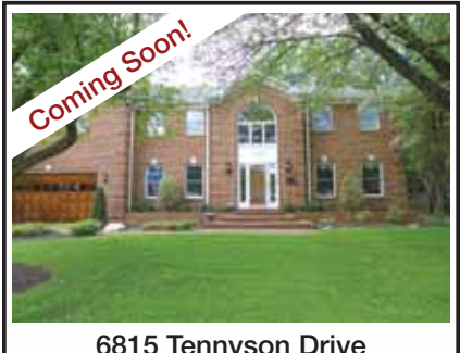
6815 Tennyson Drive $1,385,000