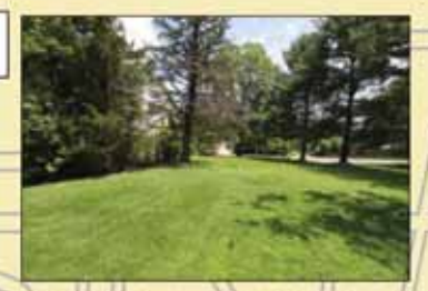
1630 Great Falls Street McLean, 22101 $570,000

Call Me Today for a Free Analysis of Your Home's Value!