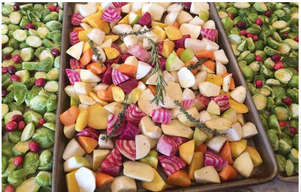
Cutting fresh produce into bite-sized pieces can make school lunches appealing to children, advises Terri Carr of Terri's Table.