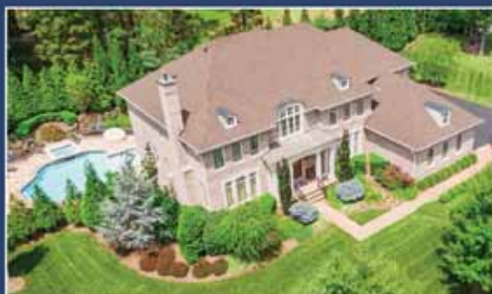
11196 Branton Ln, Great Falls $2,150,000