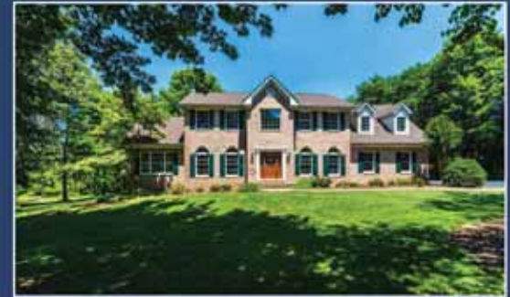
607 Kentland Dr, Great Falls $1,150,000