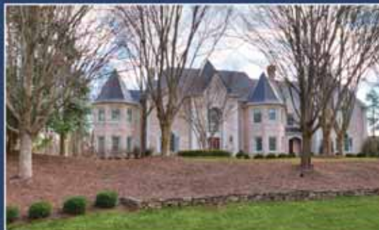
10010 High Hill Pl, Great Falls $3,595,000