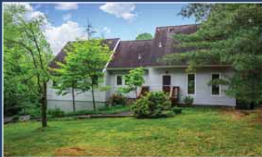
10929 Beach Mill Rd, Great Falls $875,000