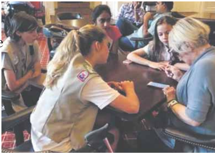
Team members working with a resident and her iPhone.

The Girl Scout Silver Award is the highest recognition a Cadette (grade 6-8) can earn and must be a minimum 50-hour community service project which includes planning and execution.