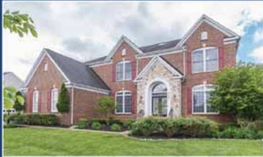
43985 Indian Fields Ct, Leesburg $1,124,999

If you're buying or selling a home, think of this as a defining moment.