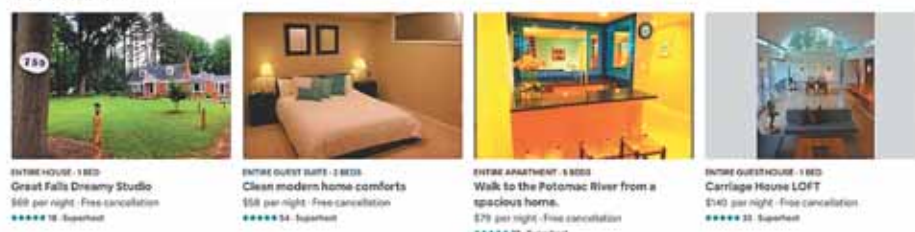
POSSIBLE LISTINGS THROUGH SHORT-TERM RENTAL SITES, INCLUDING MCLEAN AND GREAT FALLS.

als such as those advertised on Airbnb, VRBO and FlipKey.