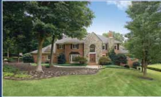
10859 Patowmack Dr, Great Falls $1,649,000