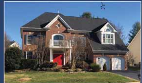
47746 Blockhouse Point Pl, Sterling $790,000