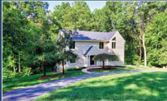
10714 Milkweed Dr, Great Falls $1,150,000