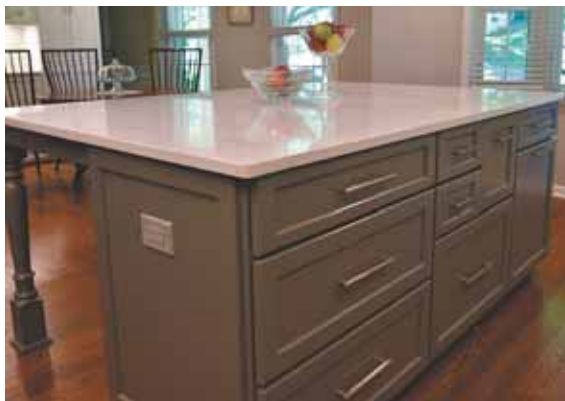
This kitchen by Nicely Done Kitchens and Baths features custom cabinets of painted Maplewood and quartz countertops. An abundance of drawer space helps with organization.

"After the new closet was installed, I spent the better part of two days helping this teen fill the closet with all of her belongings, putting things where they were visible and readily accessible," she said. "Organization is important primarily because of the time it saves. If you can find what you need to get out the door right away, you can sleep 20 minutes later."