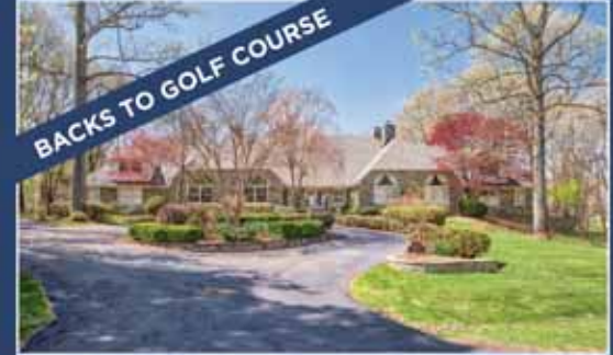
495 River Forest Dr, Great Falls $2,099,000