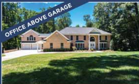
1070 Dougal Ct, Great Falls $1,499,000