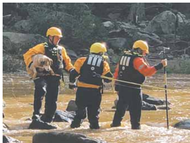
Swift water personnel were able to return the dog safely to its owner without injury.

With potential rain still in the forecast for the near future, everyone should remember to exercise caution while near any waterway as conditions can turn unexpectedly hazardous quickly. In this case, bystanders did the correct thing by staying out of the water, contacting 9-1-1, and helping identify the exact site of the emergency.