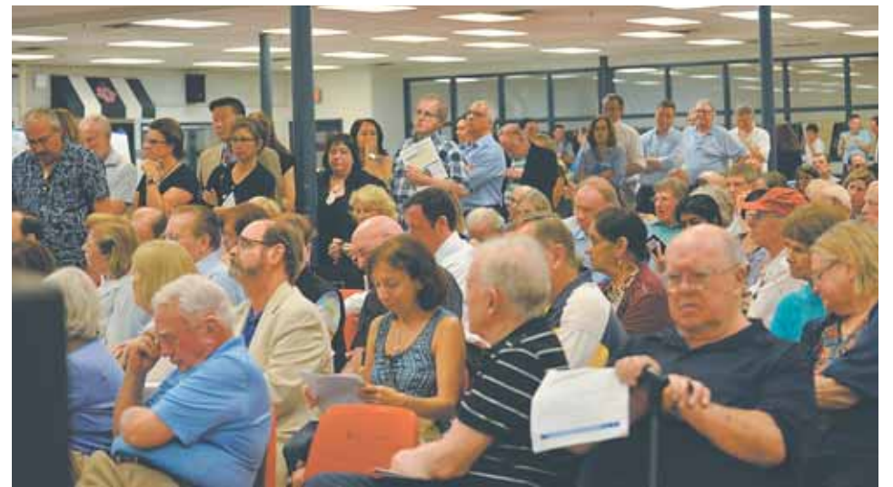
Having their say: Several hundred attended the public meeting to discuss the VDOT proposal to test closures on the Georgetown Pike ramp to I-495. Many came prepared to make comments and lined up to do so.