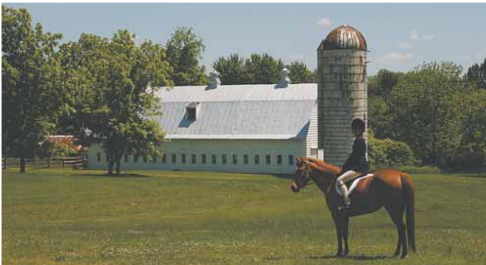
Turner Farm Park

This location on Springvale Road is the most unique of all our parks because it is so eclectic, it really is two parks in a single location. There are 40 plus acres for horseback riding where individual riders can trailer in their mounts and ride on their own and there are horse show competitions that are very exciting to watch. There is also the Observatory Park where every Friday evening you can bring your lawn chairs, blankets and telescopes and watch the sky to see what might be happening in our galaxy. The park also has a few telescopes that can be used to observe the sky. I have been to the park and seen the space station go over a couple of times and have even observed a meteor or two streak across the sky.