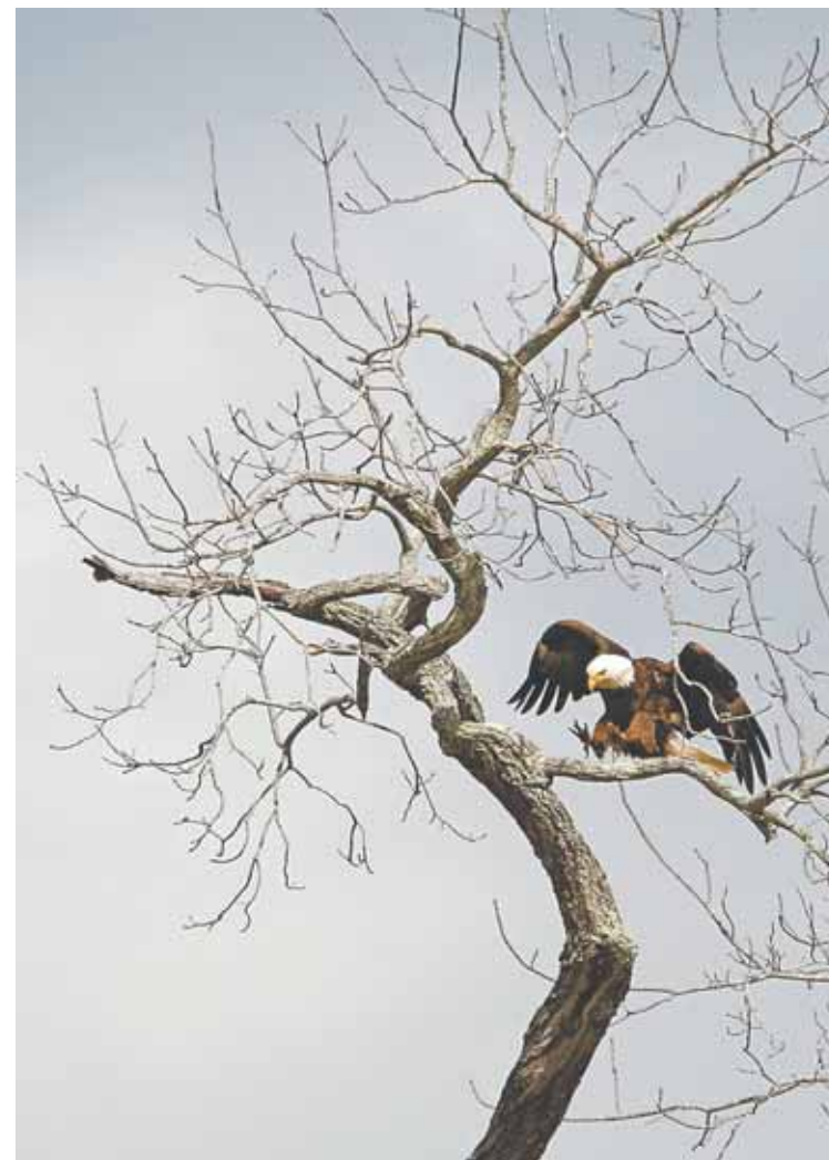
Bald Eagle at Riverbend