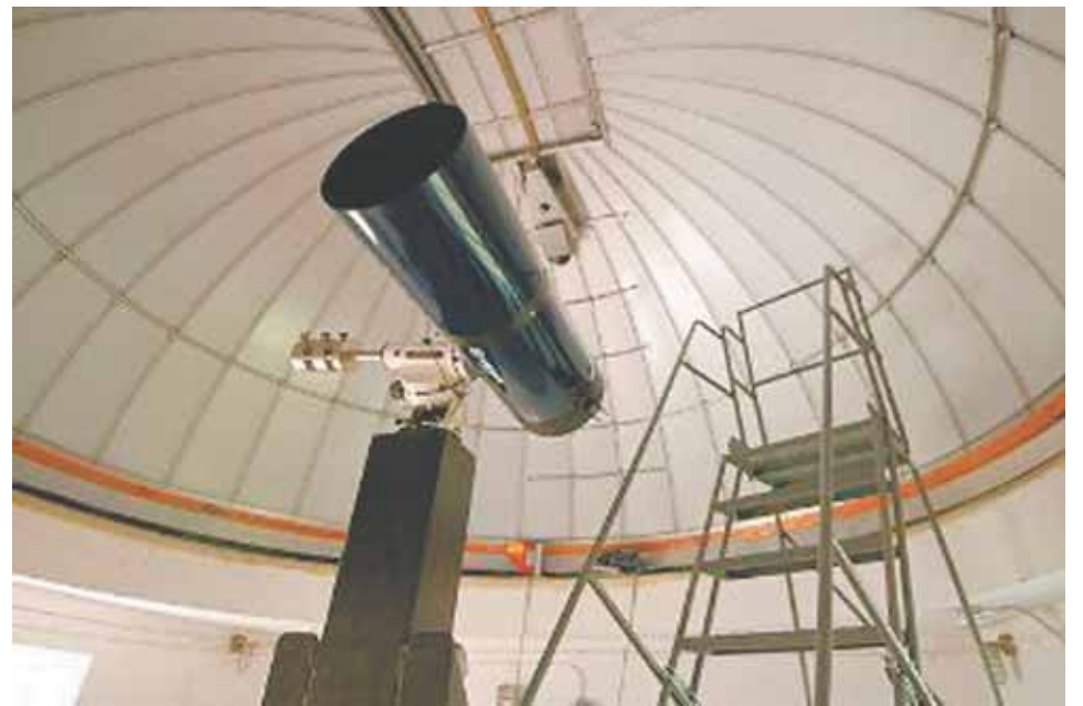
The Orientation Room is an instructional space for educational programs. The observatory features a retractable roof that rolls over the top of the fixed roof that covers the Orientation Room.