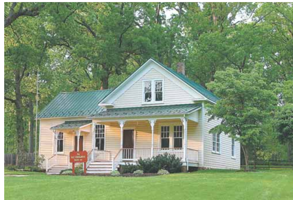
The Old Schoolhouse