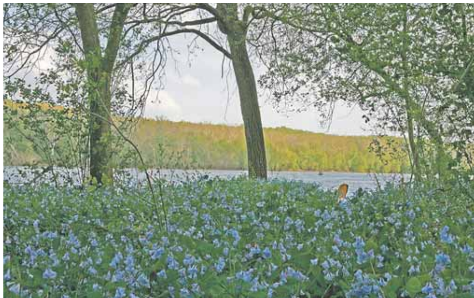
Bluebells at Riverbend