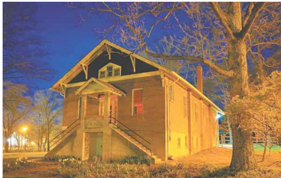
Great Falls Grange at Night