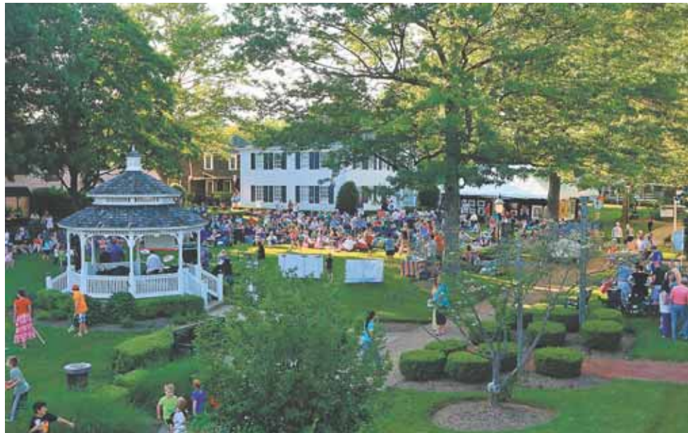
Sunday Evening Concert on the Green