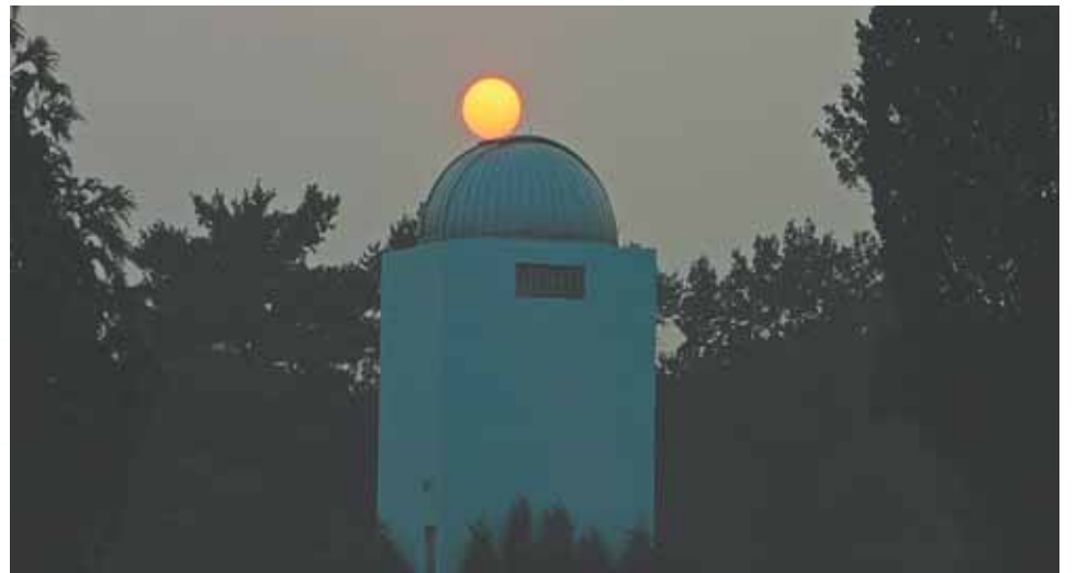
Setting Sun at Observatory Park