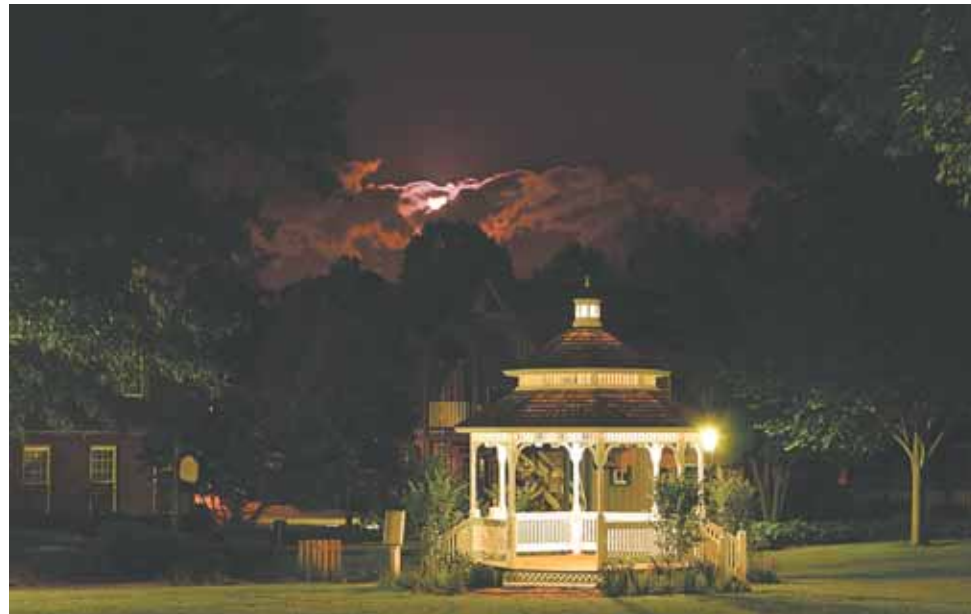
Village Centre Bandstand at Night