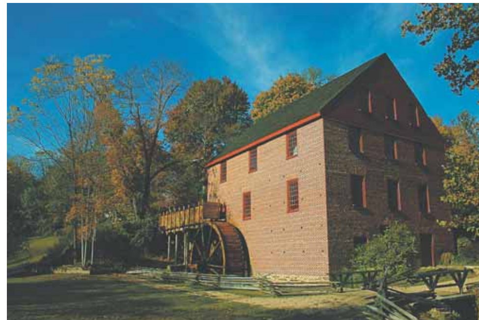
Colvin Run Mill