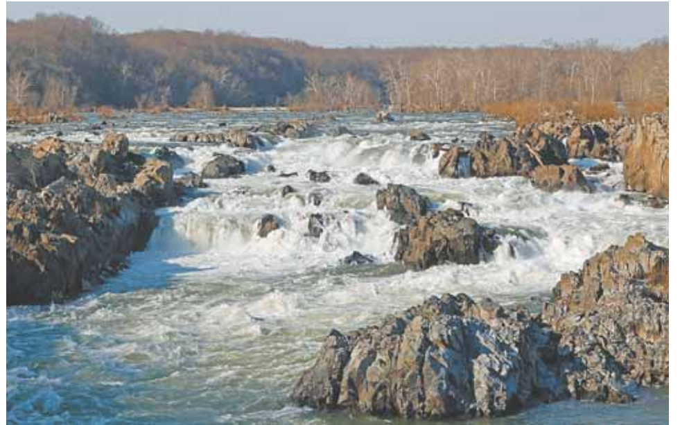
Great Falls in Early Spring