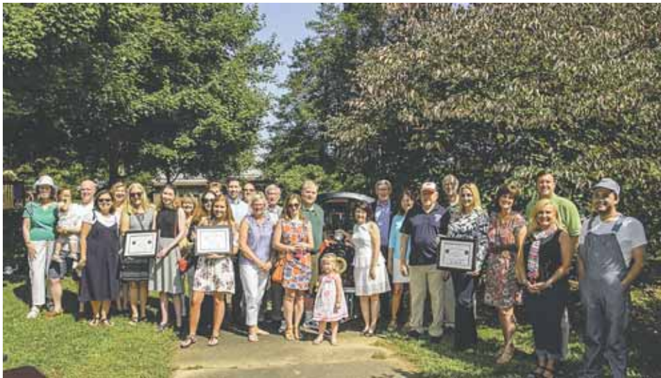
Ribbon cutting for new trackless train and picnic shelter at Clemjontri Park.