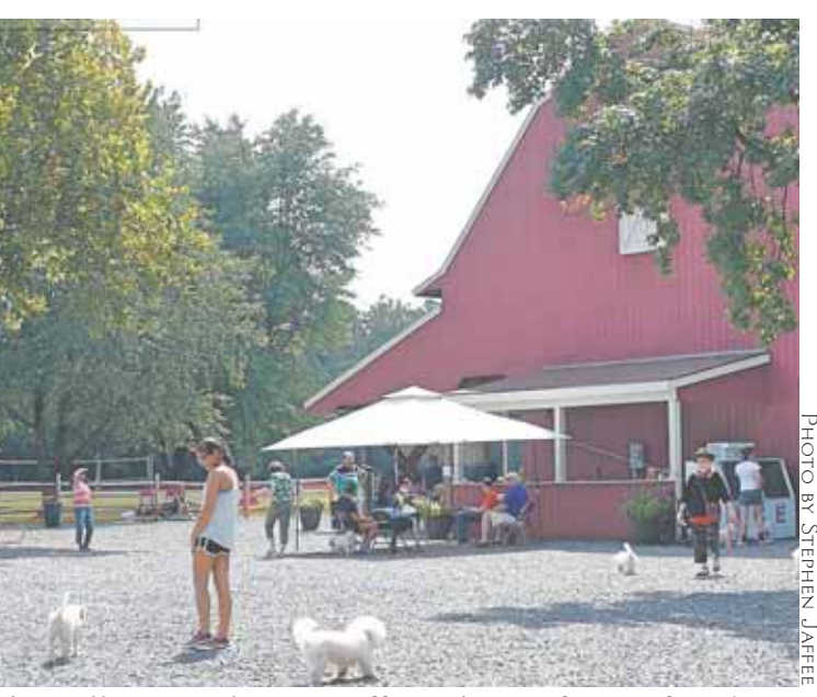
The Bull Run Park venue offers plenty of room for Bichons and their families.

Wine Tasting. 10:30 a.m.-2 p.m. at The Winery at Bull Run, 15950 Lee Highway, Centreville. The Northern Virginia Conservation Trust (NVCT) will be hosting an exclusive wine tasting in celebration of a critical effort made to conserve historic property adjacent to The Winery at Bull Run. The Stonebridge Property, located next to the winery and the Manassas National Battlefield, is officially conserved in perpetuity.