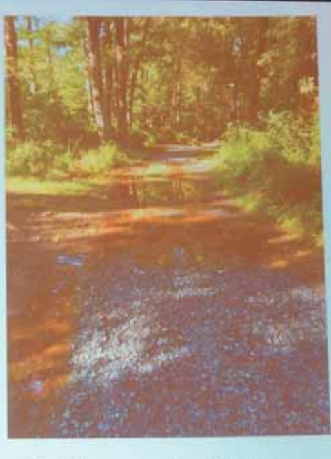
Puddles cause trail to be widened and braided