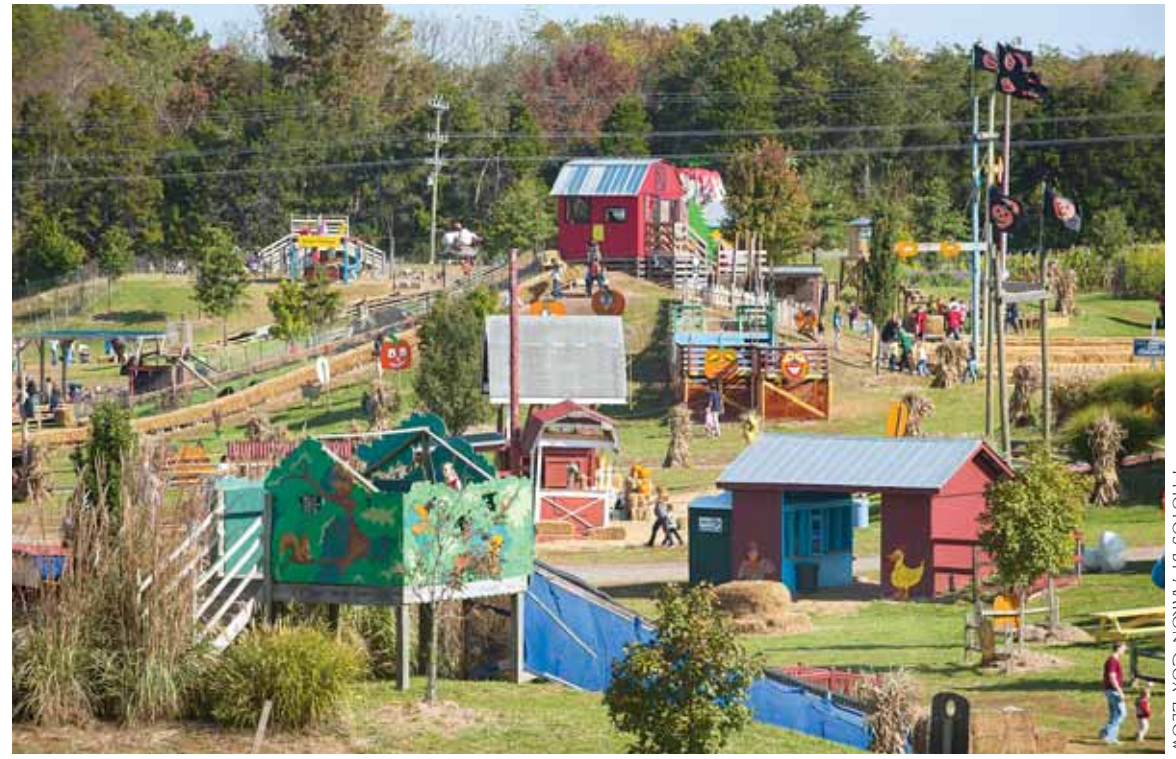
A view of Cox Farms from a distance.

how we could address those concerns to improve the customer experience, and we tried to tackle those challenges."