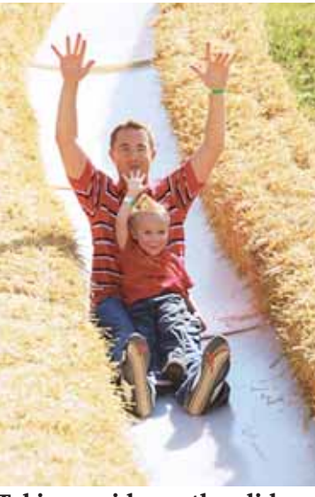
Taking a ride on the slide at Cox Farms. The annual Fall Festival will run daily from Sept. 22 to Nov. 6.

To support local public servants, Cox Farms offers a $5 discount on up to four Fall Festival tickets to public servants during the Public Servants Weekend on Sept. 22-23 this year. Government employees, educators, first responders, law