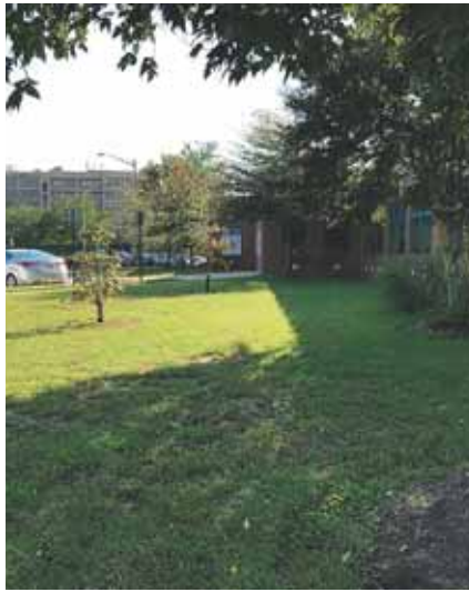
The Mount Vernon Governmental Center is one example of the use of natural landscaping to improve County properties.