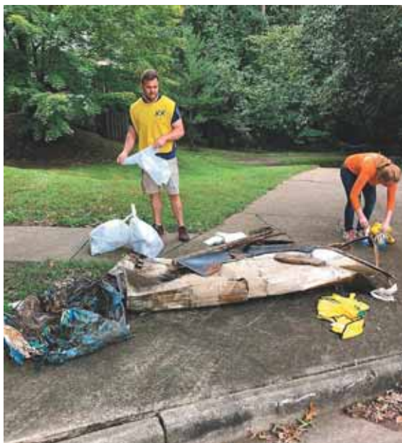
Among the items removed was this garage door.