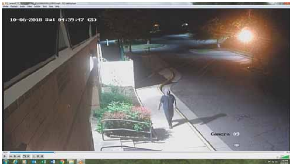
Detectives are asking for the public's help in identifying the person who spray painted swastikas on the Jewish Community Center in Annandale.