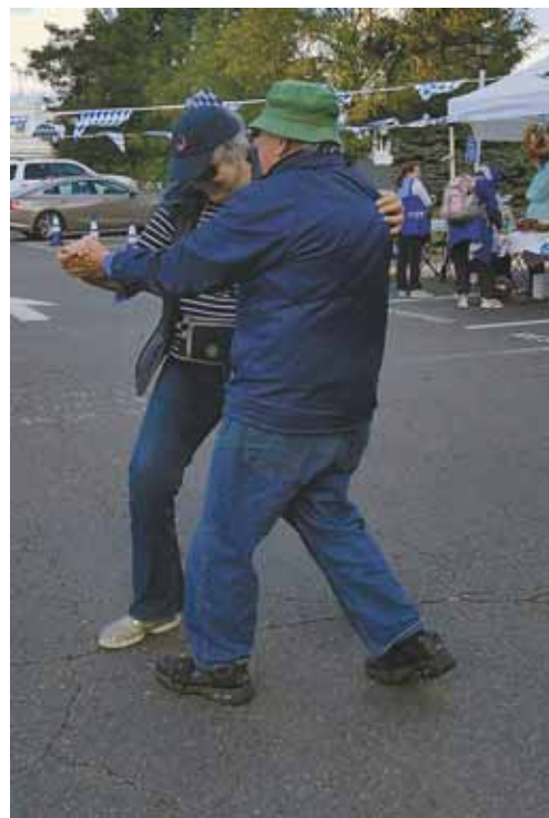
One, two, three. One, two, three. A couple twirls to the polka along with the Alpine music of Liab' Und Schneid at the Marymount Farmer's Market Oktoberfest on Saturday, Oct. 13. Liab' translates to sweetness while Schneid is bold and full of spirit, two traits admired in girls and boys in Germany.