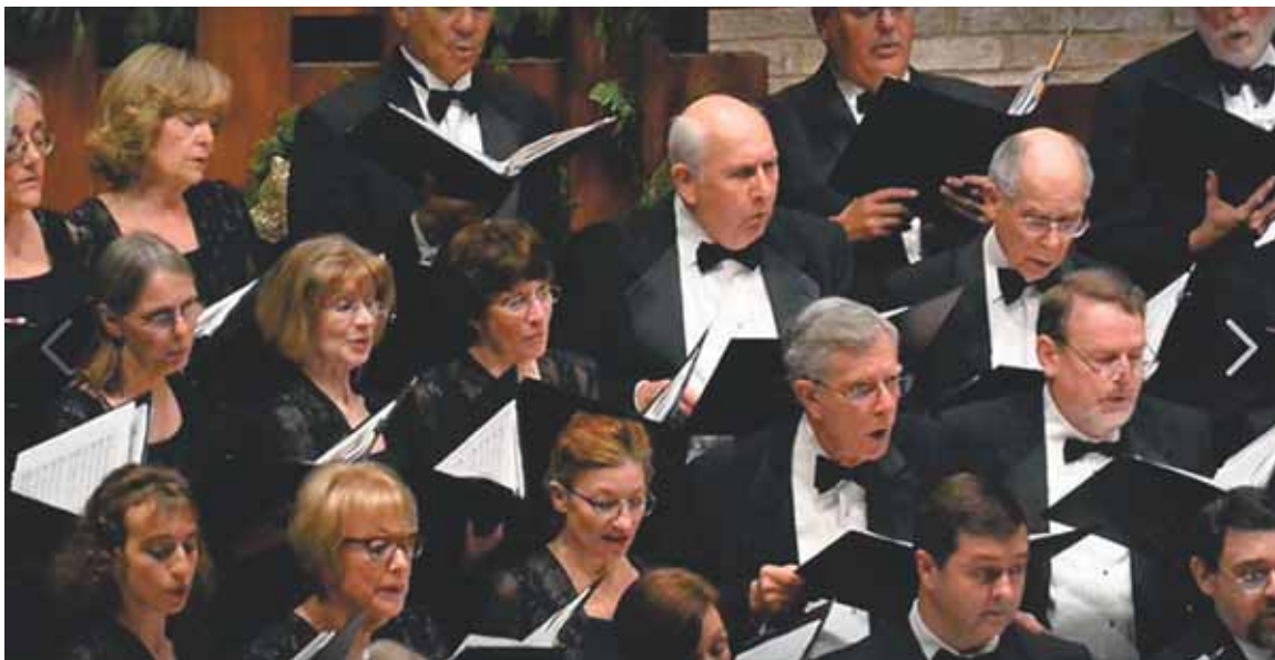
The Arlington Choral