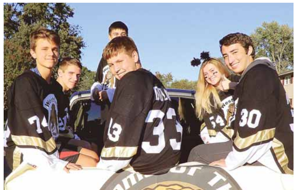
Westfield Ice Dogs Hockey Team.