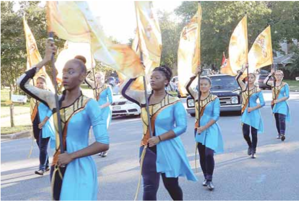
Color Guard members carry their flags high.