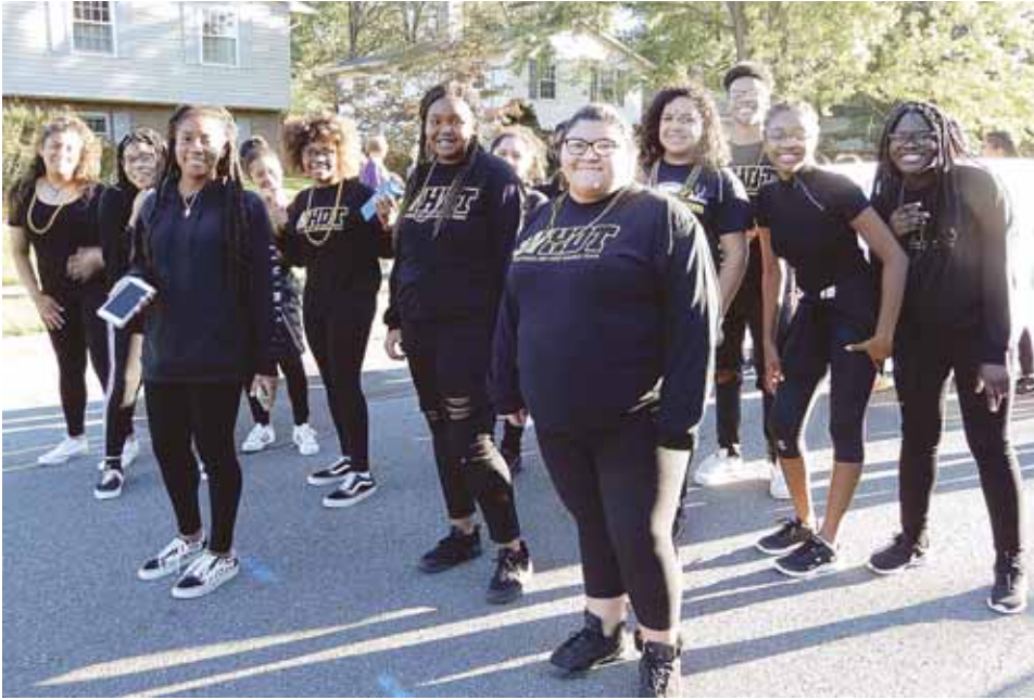
The Hip Hop Dance Team.