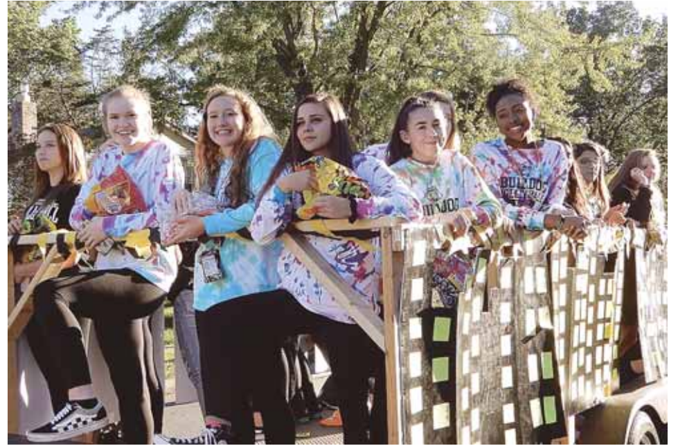
The Volleyball Team enjoys the ride..

Westfield Dance Team members show their school spirit.