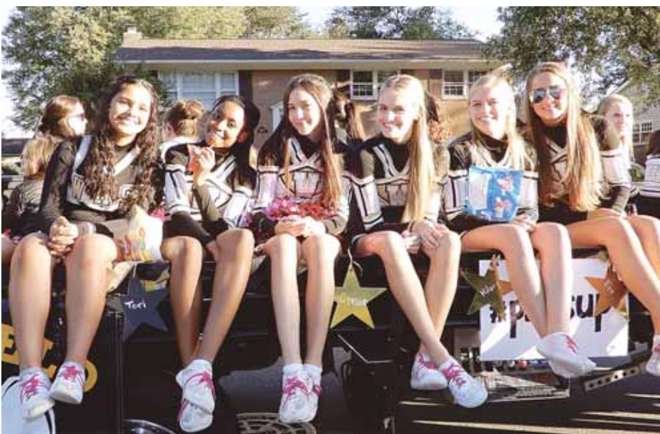
Cheerleaders smile at the spectators.