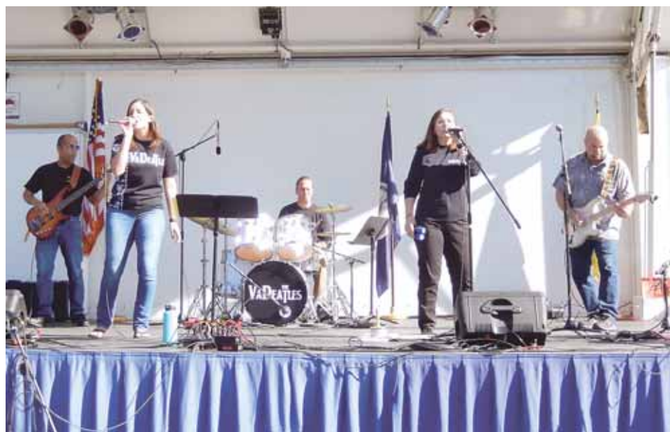
Stone Middle School teachers will again play rock music as the VaDeatles.