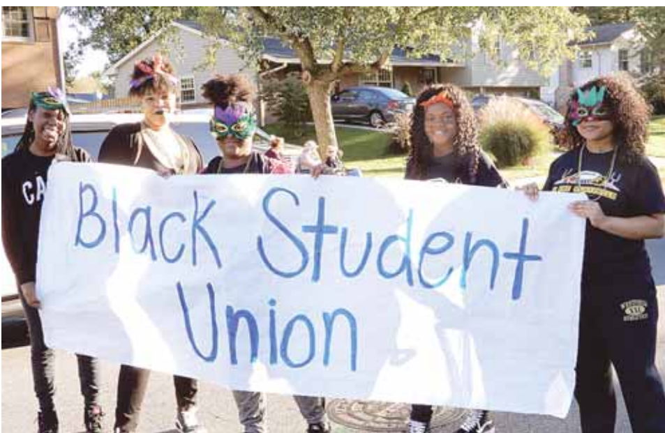
Members of the Black Student Union.