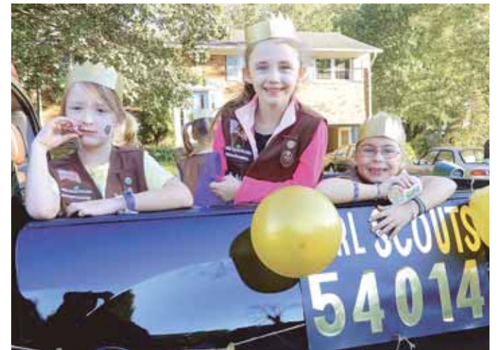
Girl Scout Troop 54014.