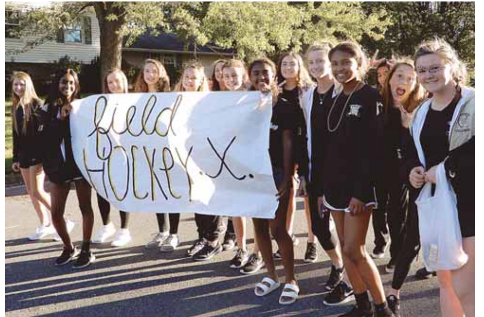
Bulldog Field Hockey Team members.