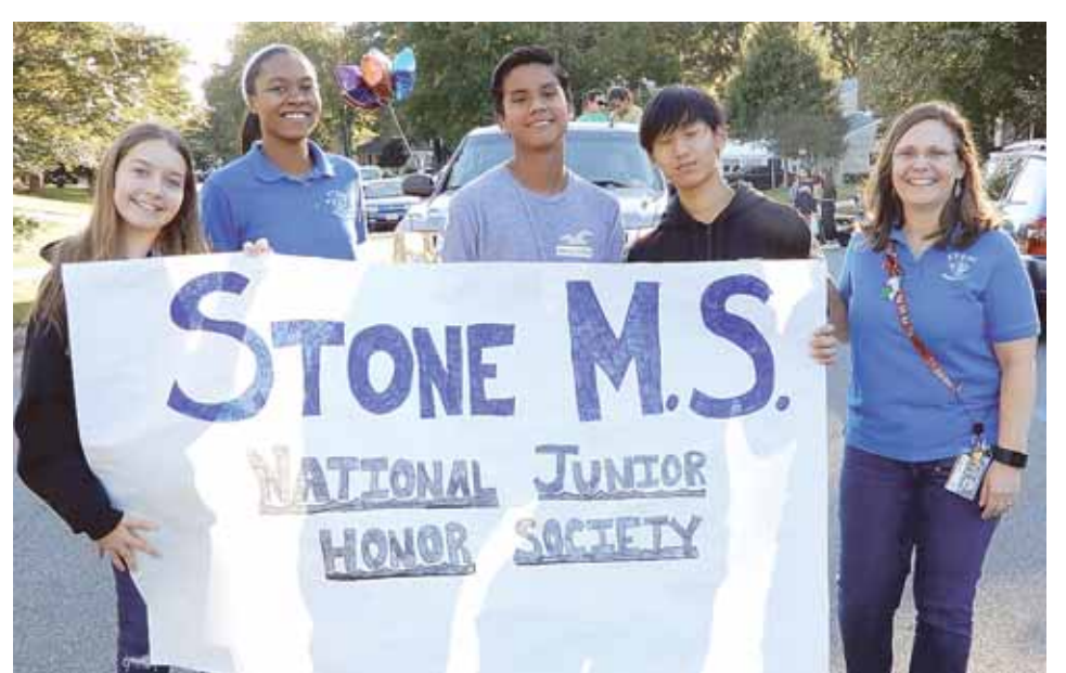
Stone Middle School National Junior Honor Society.