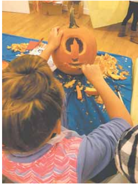
Investing in a set of carving tools helps create impressive Halloween pumpkins.

After the parent-child duos have donned aprons and the pumpkins are placed atop tables covered with plastic and topped with newspaper, the instruction begins. A set of