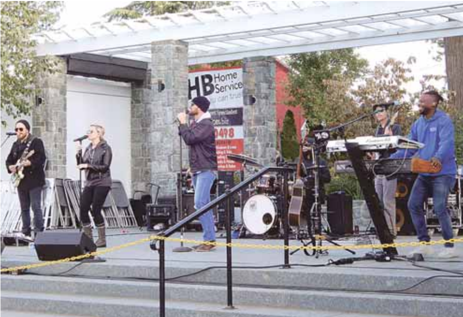
Stellar Mojo rocked the crowd in Old Town Square at the after-festival concert.