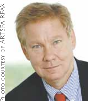
Former U.S. Rep. Tom Davis, ARTSFAIRFAX 2018 Arts Awards Event Master of Ceremonies.

Master of Ceremonies for the 2018 ARTSFAIRFAX