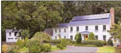
Clifton/Redlac Forest - $1,049,900

Hermendorfer Associates Top 1% of Agents Nationally