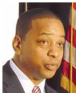
Lt. Gov. Justin Fairfax