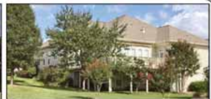
Heritage Hunt 55+

Prestigious 2-lvl home - main lvl & walkout LL, 5 BR, 3.5 BA, 10' ceilings, open flrplan, Grmt Kit, Brkfst, Fam rm off Kit, Liv, Din, Office, NEW MBA, NEW roof, HDWDS, Rec rm, Craft rm/Wshp, Lg Deck w/awings, 2 HVAC, Storage, 3-car Gar, Golf crs views. Please call for information.