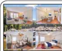
Occoquan Condo $180,000