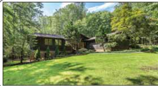
Fairfax Station $789,900

Private retreat on 5-acres of natural surroundings perfect for entertaining or casual living * 5 bedrooms & 3 baths * Updated kitchen, baths, roof plus much more * Wood floors * Fireplace in family rm * Master bedroom with private balcony * Multi-level decking & hot tub * Walk to Burke Lake Park * visit www.KilkennyLane.com for photos.