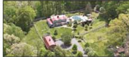
Clifton - $925,000

Charming, custom Colonial on quiet cul de sac w/ authentic pine wood floors, 9' ceilings, metal roof, and detached garage w/ finished space above! Expert landscaping, flagstone patio and fish pond, too! Robinson HS.