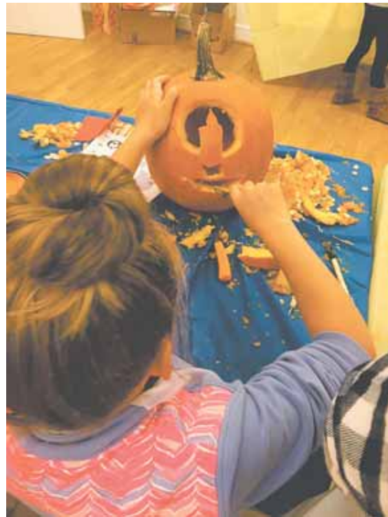
Investing in a set of carving tools helps create impressive Halloween pumpkins.

Once the tops of the pumpkins are removed and the pulp, flesh and seeds area cleared, the artistry begins. “Use a dry-erase marker to to sketch the design that you want to carve on the front of your pumpkin,” said Searby. “Does anyone know why