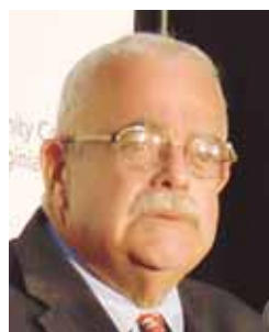
U.S. Rep. Gerry Connolly (D-11)