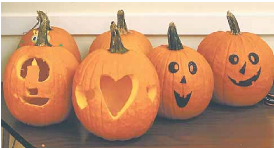
Front-porch ready Halloween pumpkins.

“If you’re going to use candles illuminate your pumpkins at night, make sure you put the candles in a glass candle holder first,” said Searby. “Now the clean-up begins. It’s a messy process after all.”