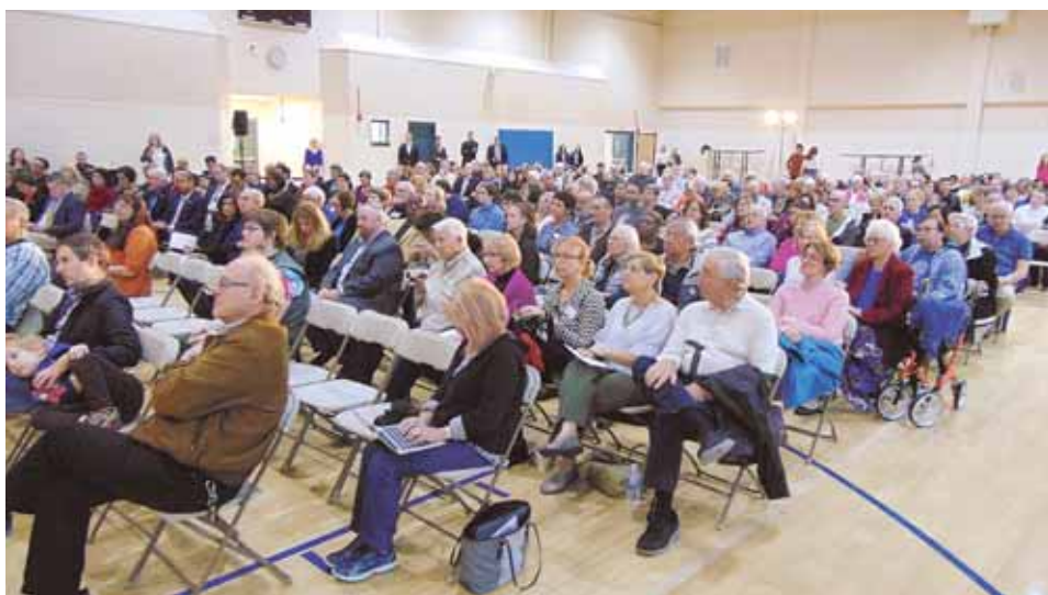
A crowd of 400 people attended the “comm-UNITY” gathering at the Jewish Community Center of Northern Virginia to affirm peace and unity on Sunday, Oct. 14.