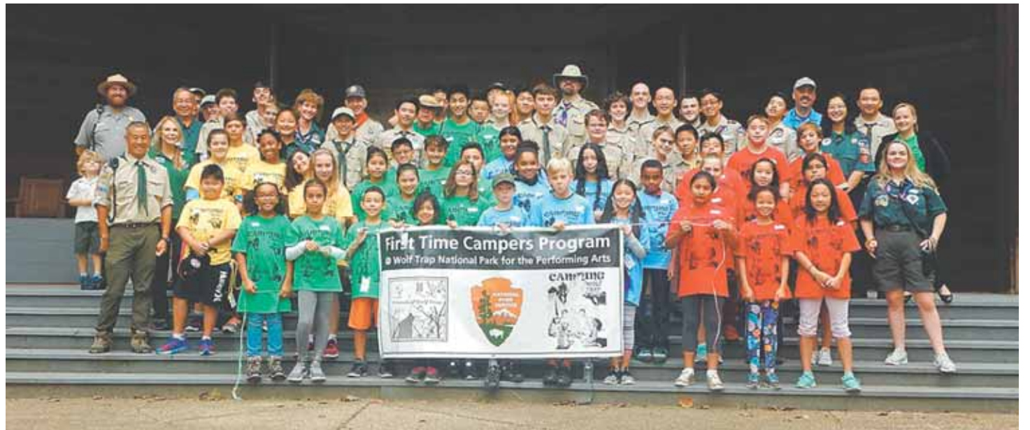
Gathering of all the troops at the 9 th First Time Campers adventure at Wolf Trap Park.

Just as being a First Timer isn’t a requirement for participation, neither is being a Boy or Girl Scout. “Kids come here, they may or may not want to get involved with Scouting afterward, but all are welcome,”