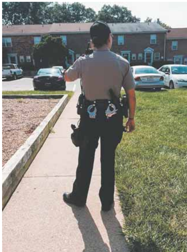
New report credits police with “substantial and meaningful reform.”