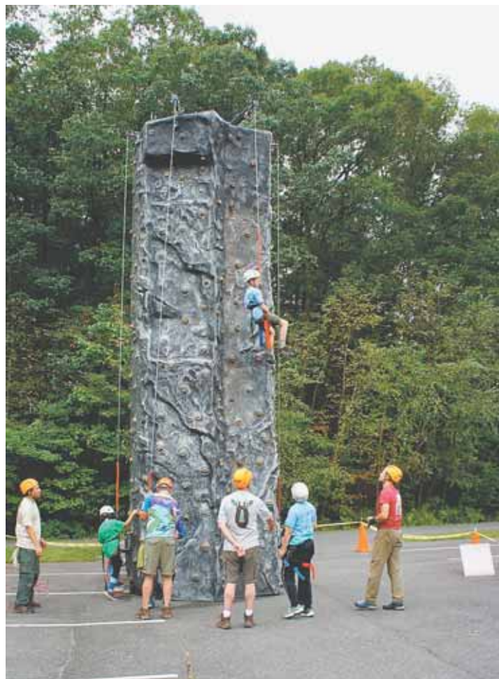
Taking on the Wall: Some of the youngsters at the First Time Campers overnighter challenge themselves on the rock climbing wall.