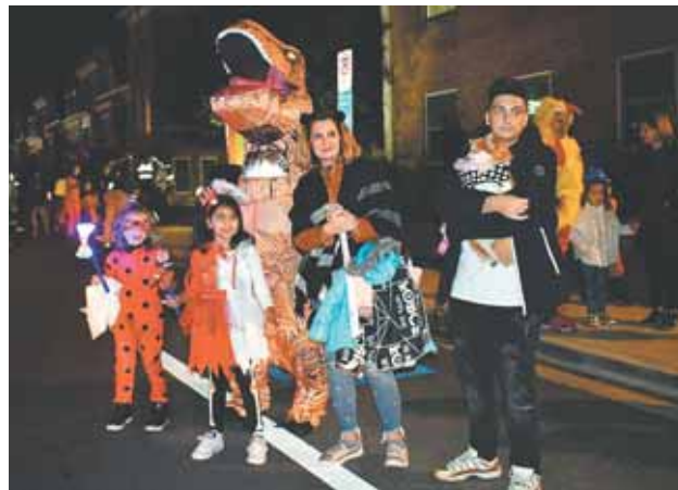
A family including a T-Rex watch as the parade goes by.