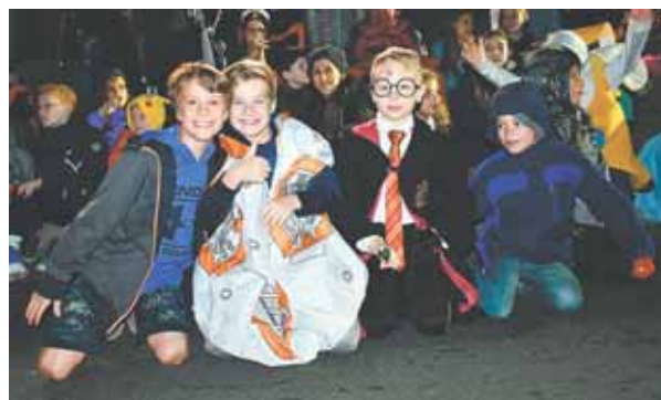
BB8, Harry Potter and friends sit on the sidelines and watch the parade.