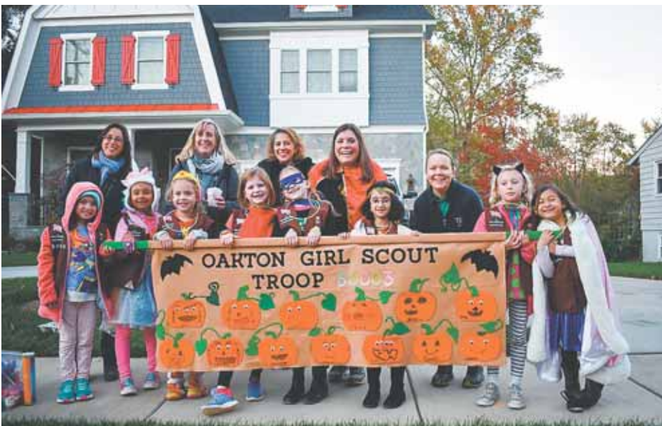
Brownie Girl Scout troop 500003 and 50020 pose with their handmade sign ahead of marching in the parade.