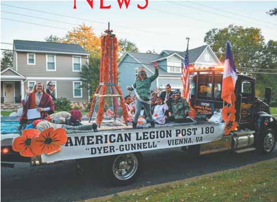
A young girl dressed as Amelia Earhart cheers from the desk of the American Legion Post float.