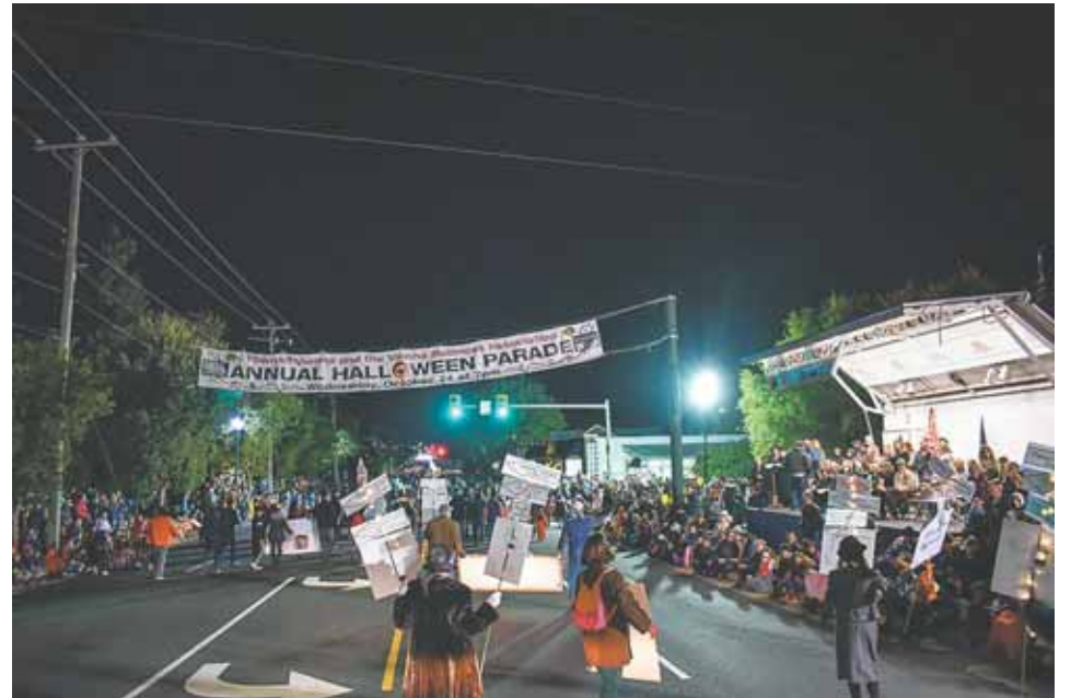
Floats pass by the stage.