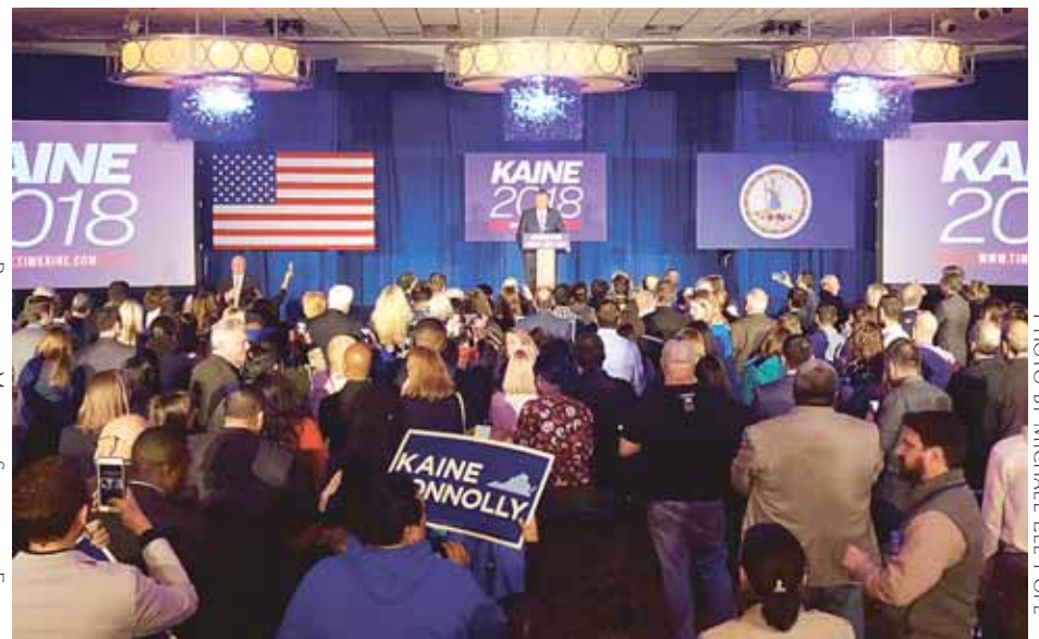
Former Gov. Terry McAuliffe tells the crowd assembled at Tim Kaine's victory party that voters in Virginia rejected President Donald Trump's campaign of "fear, hatred and division."