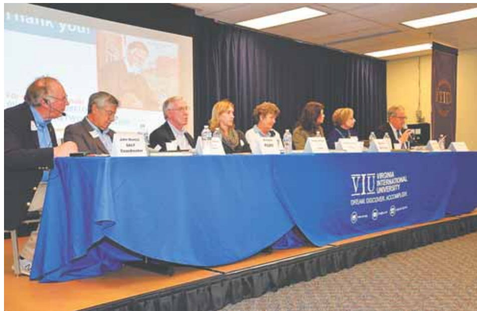
The panel, representing faith-based social justice organizations and Virginia's elected officials, address the attendees at the annual conference of Social Action Linking Together.