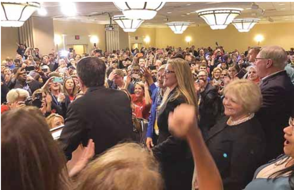
Packed house to celebrate Jennifer Wexton's win in the 10th Congressional District.