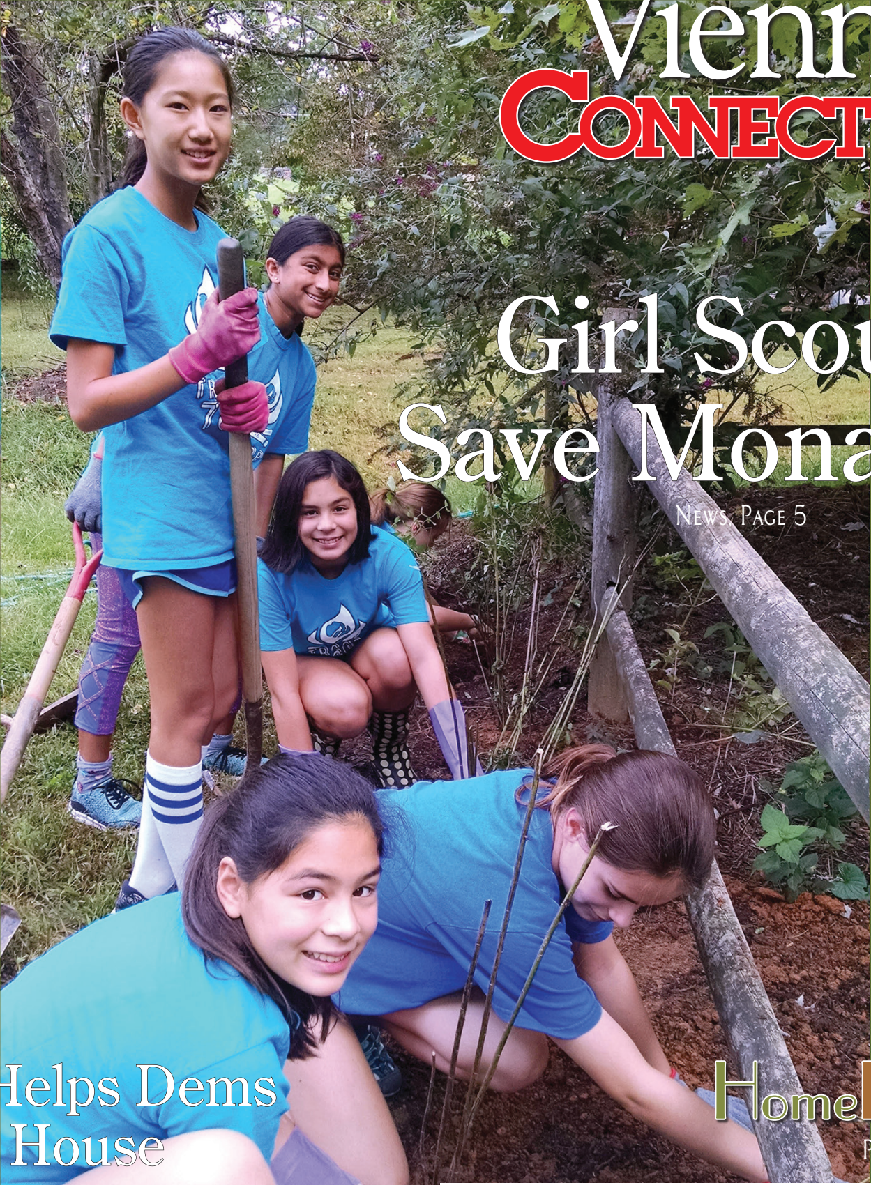
These Oakton Girl Scout conservationists are doing their part to create monarch habitats in the area.

PHOTO CONTRIBUTED OPINION, PAGE 4 ♦ ENTERTAINMENT, PAGE 8 ♦ CLASSIFIEDS, PAGE 10