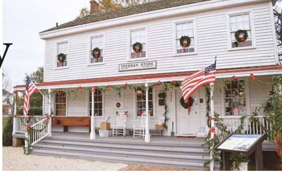
The Freeman Store and Museum decorates for the Christmas holiday.

Editor's note: Of course, every day is Small Business Day at the Connection.