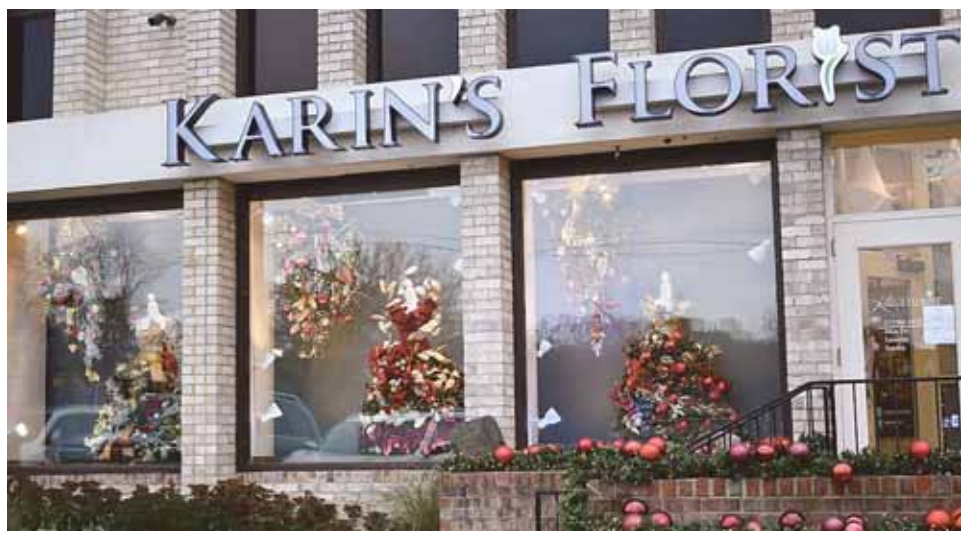
Karin's Florists' windows were inspired by floral fashion.