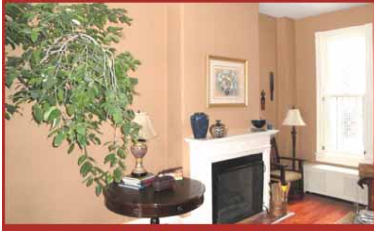
inside and out!