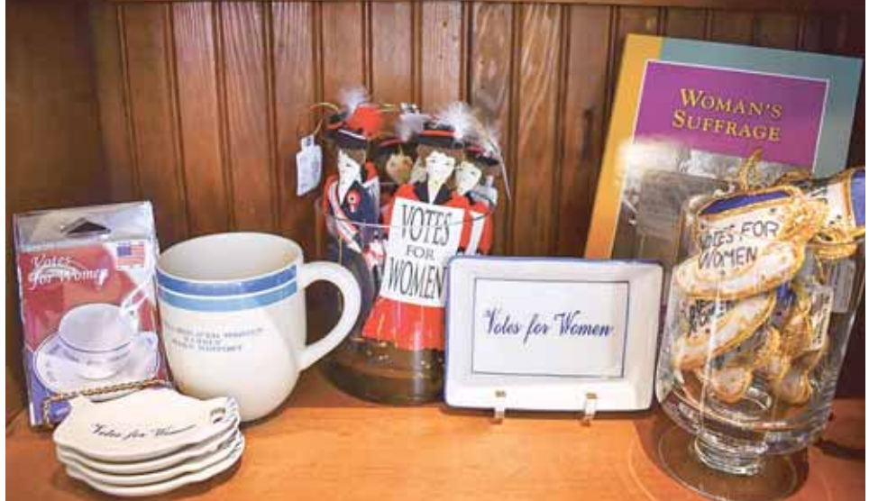
New items at the Freeman Store and Museum include Votes for Women ornaments.

FAIRFAX | 8905 ARLINGTON BLVD. | SUITE 300 | 703-698-9335 • ALEXANDRIA | 6354 WALKER LANE | SUITE 100 | 703-313-8822 TYSONS • STERLING • MANASSAS • WOODBRIDGE