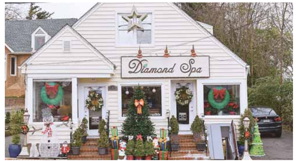
Diamond Spa decorates their store front for the Vienna storefront decoration competition.