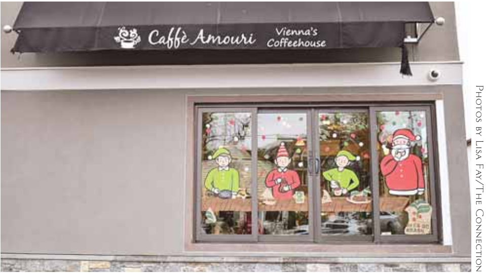
Santa and his elves enjoy a cup of coffee at Caffè Amouri.

WANTING THE BEST FOR YOUR BABY STARTS BEFORE THEY'RE EVEN BORN.