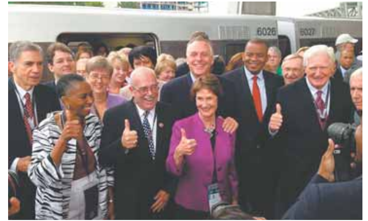
Silver Line Phase 1 Opening Day.