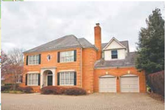
3 18 Beman Woods Court — $1,505,000