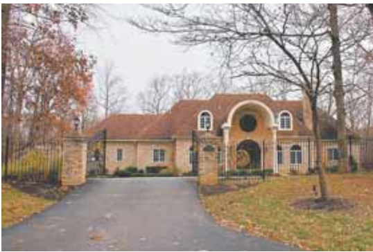
4 14401 Pettit Way — $1,350,000