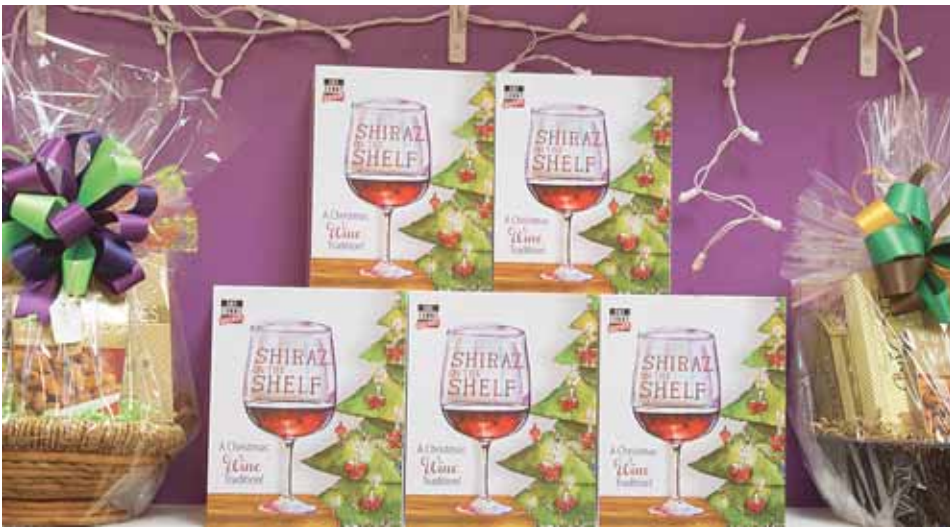
A unique gift from Occasions is “Shiraz on the Shelf” a copy of “Elf on the Shelf” for wine lovers.