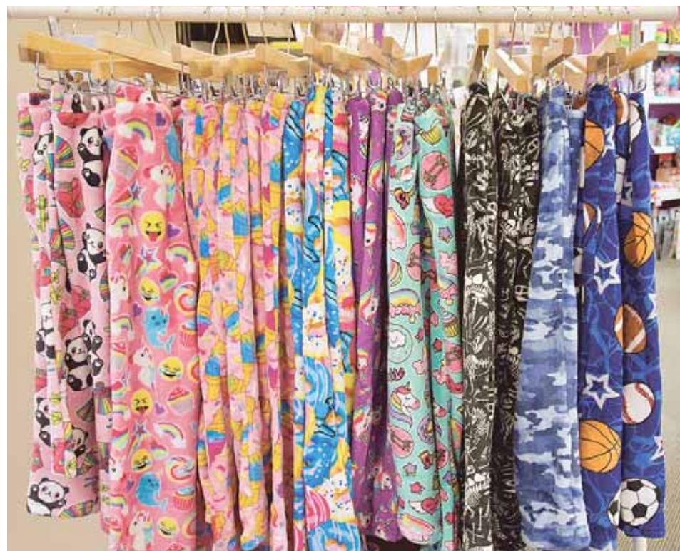
More gift ideas from Occasions include warm cuddly pajama pants.

from the owners of stores at Cabin John Mall. Each store stocks a variety of gifts that are sure to delight all ages from tiny tots to grandma and grandpa.