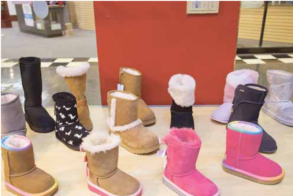
Boots of every kind from Shoe Train.