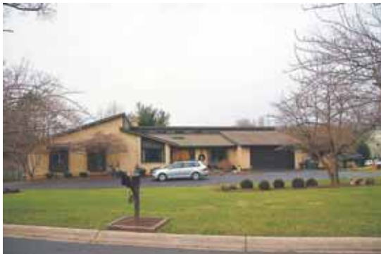
5 11612 Twining Lane — $1,299,000