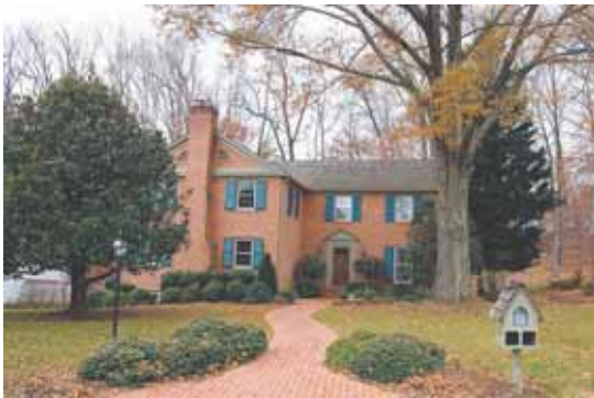
7 7812 Hackamore Drive — $1,237,500