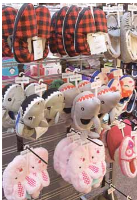
Keep your child's feet cozy and warm with slippers from Shoe Train.