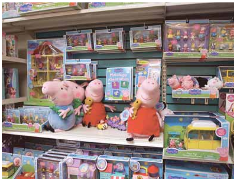
“All the rage” toys from Toy Castle.