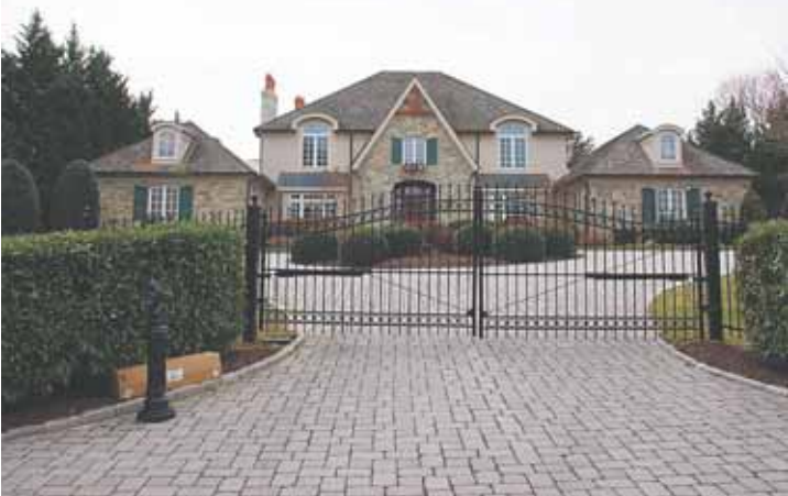
2 11400 Glen Road — $2,250,000