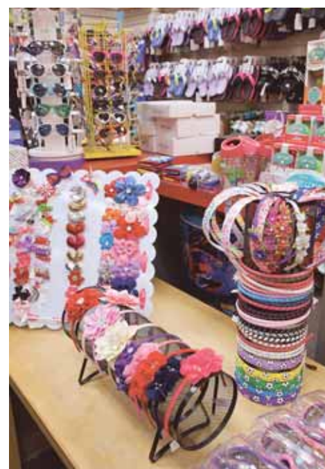
Fashion Accessories from Shoe Train are in demand.