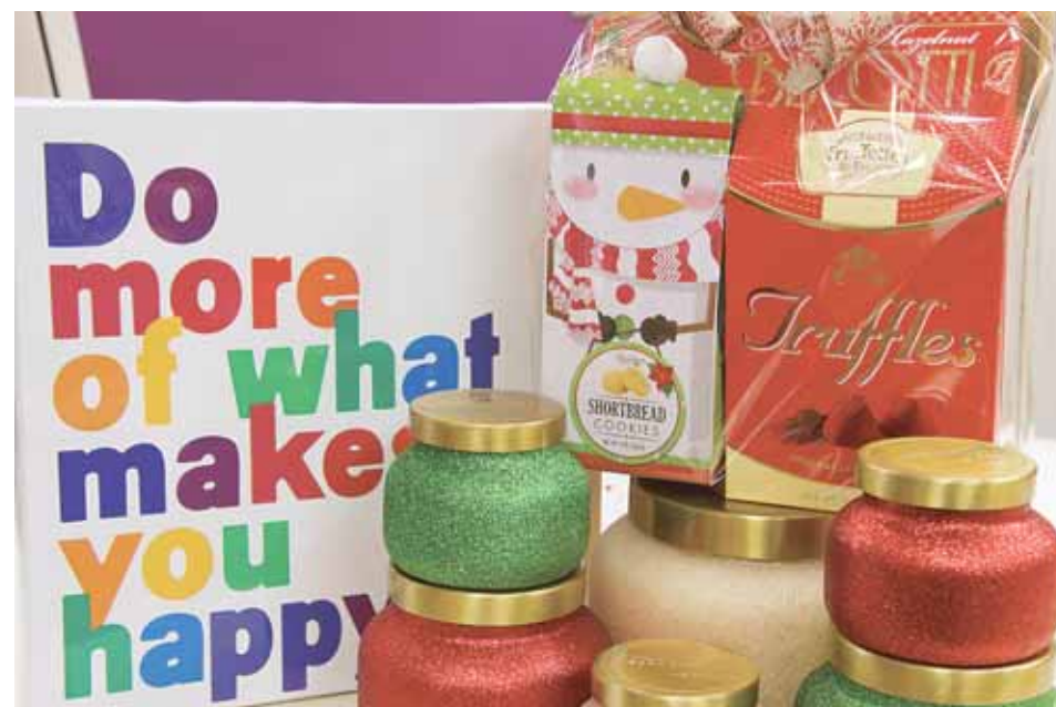
A variety of gift ideas from Occasions.