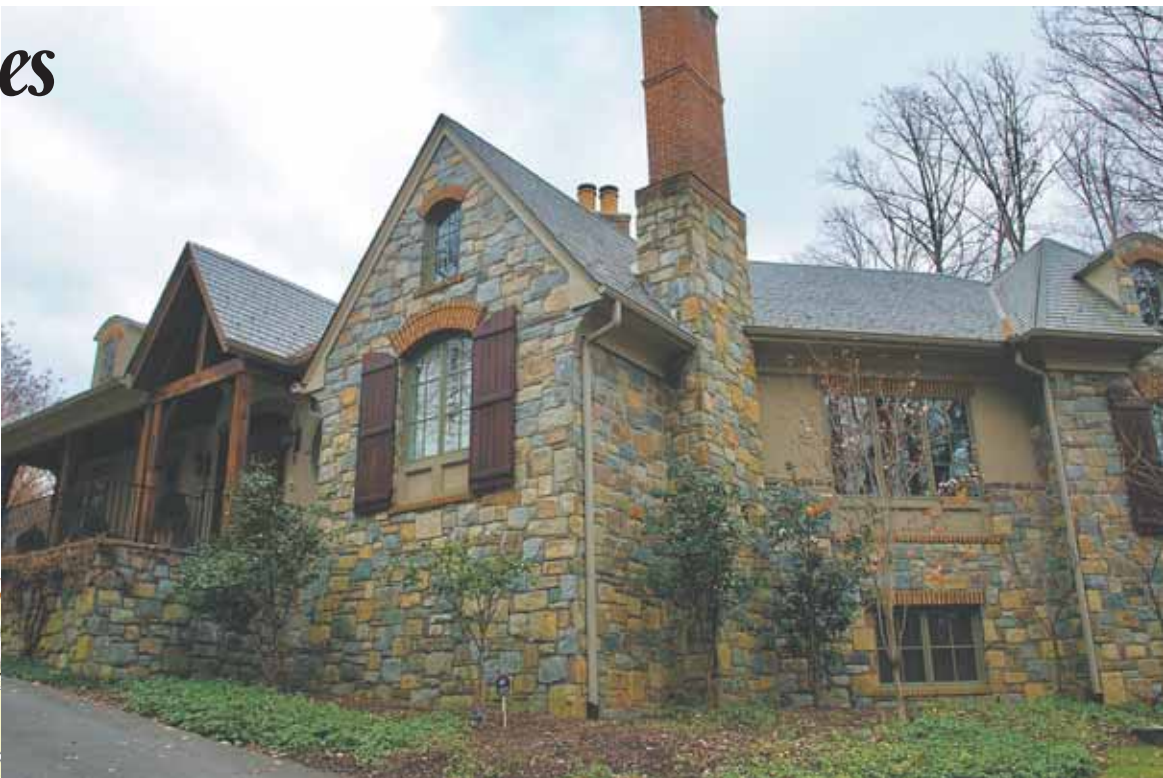
1 9305 Kendale Road — $2,850,000