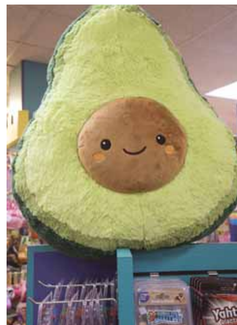
Get your avocado Squishable at Toy Castle.