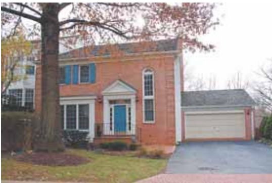
8 9480 Turnberry Drive — $1,192,000