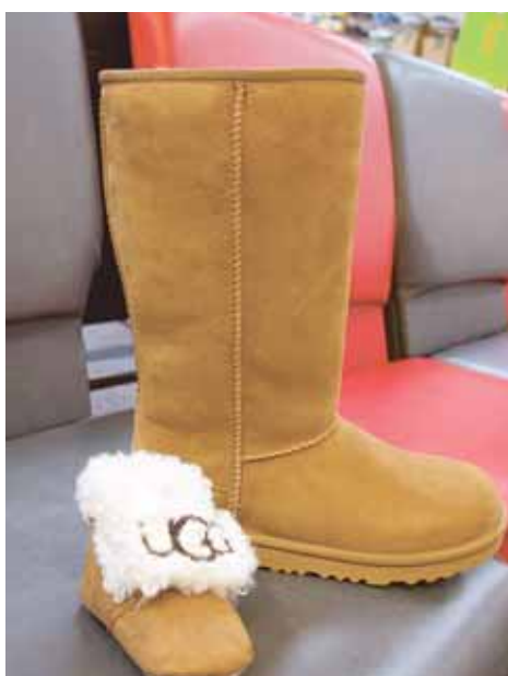
Baby and teens (and even adults) love their Uggs from Shoe Train