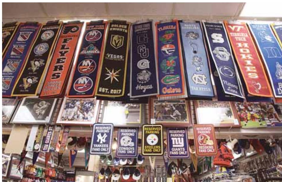
Banners from your favorite college or team sport hang high at Hall of Fame Cards and Collectibles