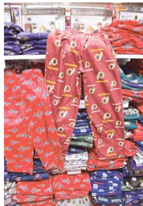
Get your favorite team's pajama pants on – Find them in with every team logo at Hall of Fame Cards and Collectibles