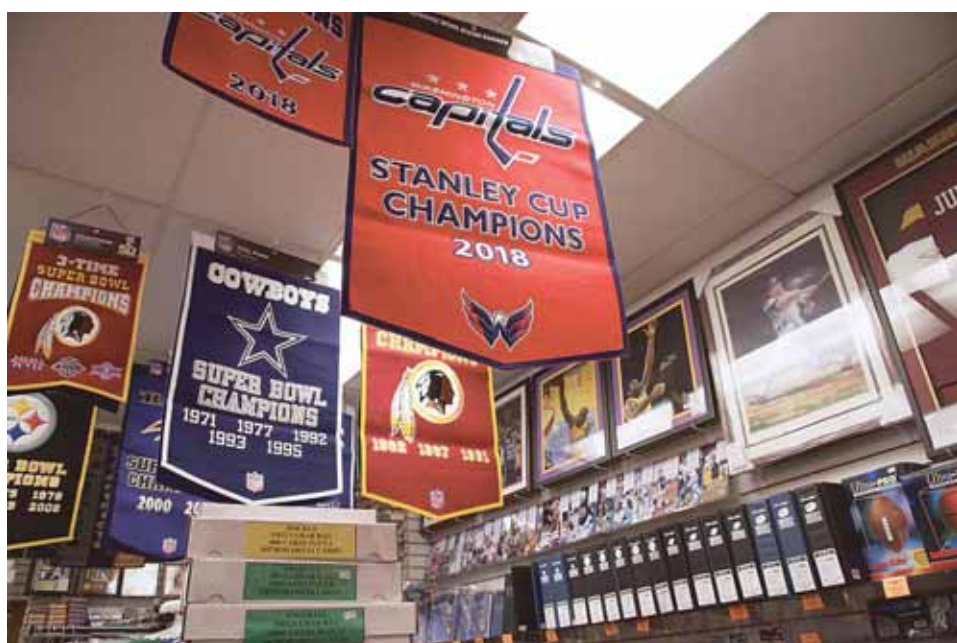
Your favorite Caps Fan would love a banner touting the Stanley Cup Champions from Hall of Fame Cards and Collectibles.