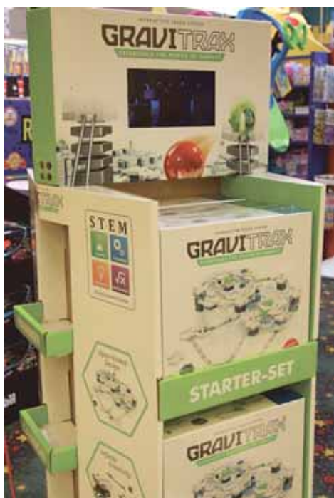
Gravitrax from Toy Castle is a “marble run on steroids.”