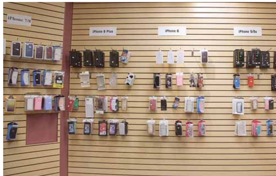
Cell Fixx provides all your cell phone and iPad needs