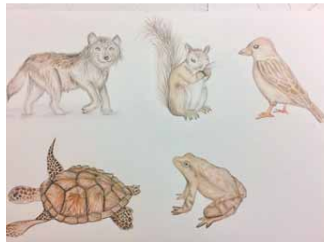
Animal Collage, Color Pencil Drawing by Audrey Reese