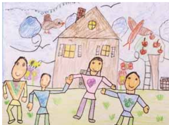
By Stanley Liang, Grade 1