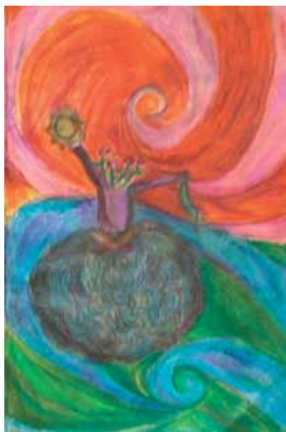
Drawing by Calvin Ashley