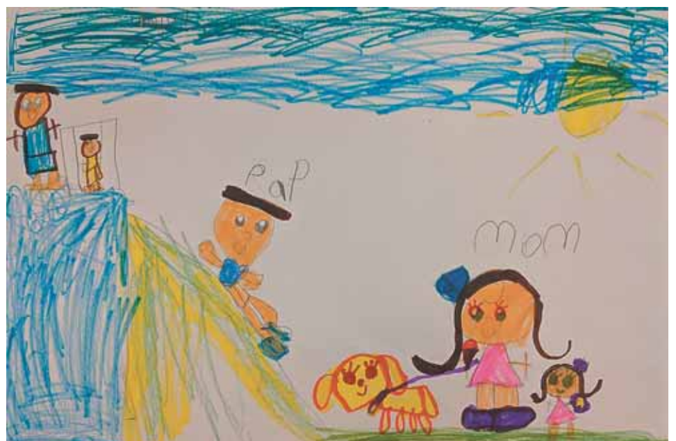
By Raquel Chacon Pena, Grade 1, Annandale Terrace Elementary

SPRINGFIELD CONNECTION ♦ CHILDREN'S & TEENS' CONNECTION 2018-2019 ♦ 3