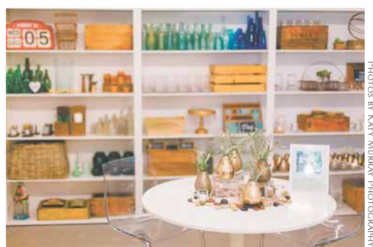
Selection of Field & Gown tabletop rental inventory.