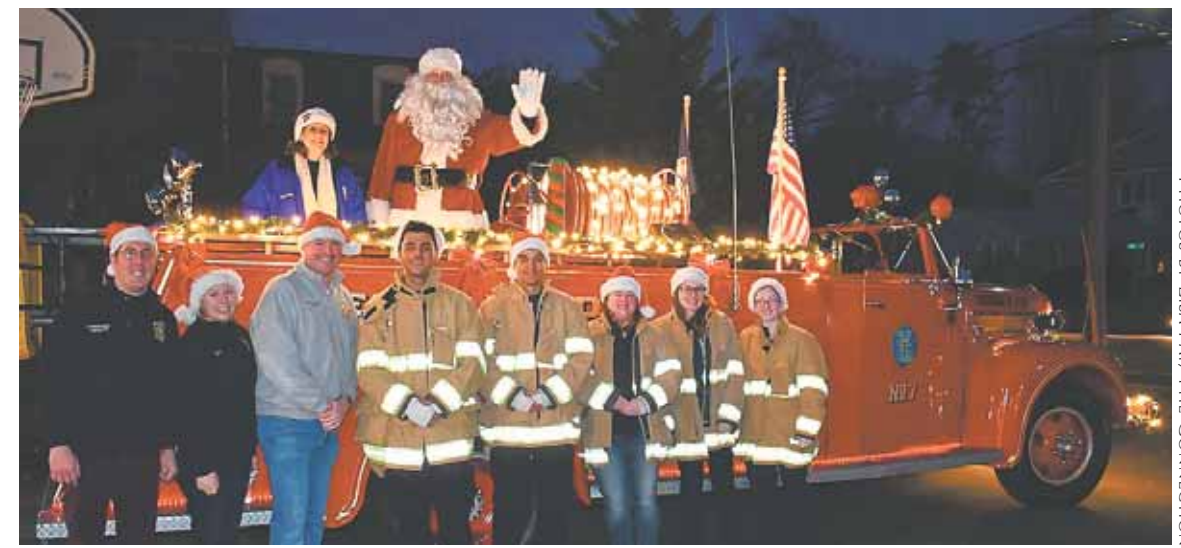
The Vienna Volunteer Fire Department members pose with their prized possession, a 1946 fire truck, as it carries Santa through Vienna neighborhoods.