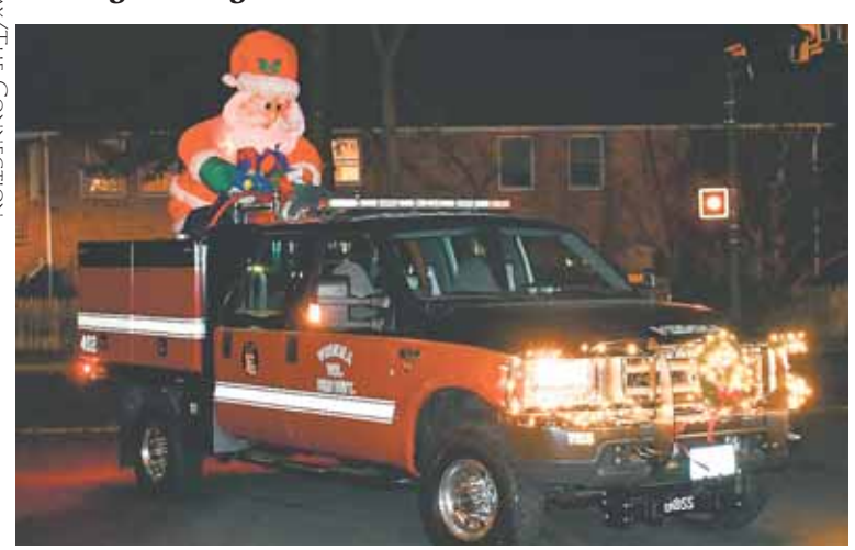
The pickup truck that acts as Rudolf adorns an inflatable Santa ready to alert the children that Santa is on his way.

crew estimates that Santa has been visiting Vienna for the past 25 years. At the end of the week duration, there is a bottomless pancake breakfast at the firehouse. Santa's schedule is posted on the