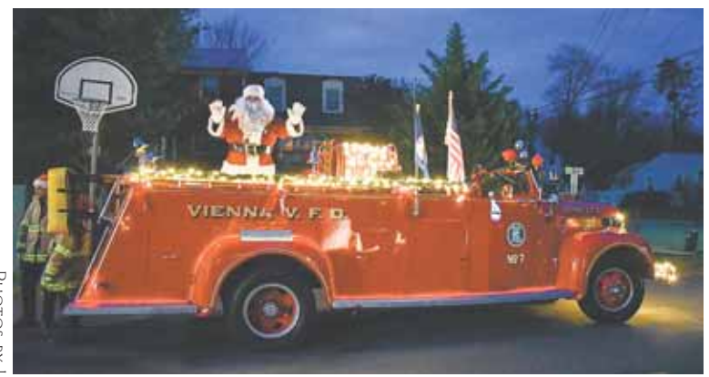
Santa gets ready to visit children of Vienna in his special fire engine sleigh.

If you catch Santa riding by, you may recognize the iconic fire engine because it is the same truck that visits the residents during the Church Street Stroll. "We bought this in 1946 but we gave it away in the early 60s. It was found in the early 90s in a barn and we brought it back, refurbished it, and it's been doing this since." The