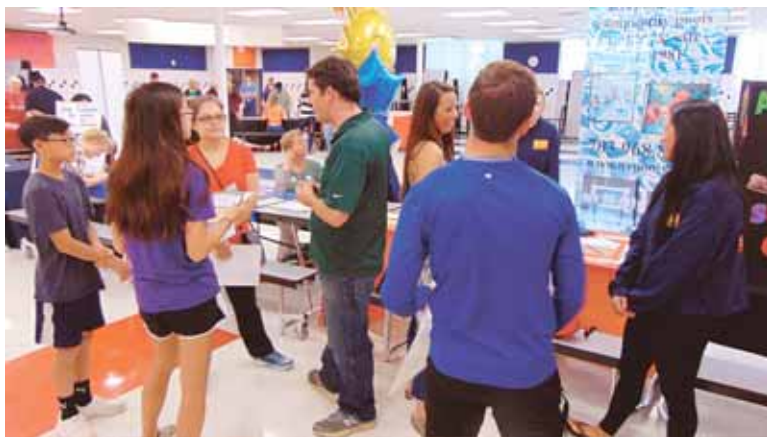
About 400 people attended the Teen Job Fair at West Springfield High School on April 28, 2018.

had made great strides implementing the 50-plus Community Action Plan in response to the unique challenges of the increasing number of older adults in our County. The Plan includes 31 initiatives regarding housing, transportation, community engagement, services, and safety and health in order to make a more vibrant, active, and supporting community for older adults. In 2019, we will begin a review of the plan and assess the emerging needs of our older adults in order to update existing initiatives and implement new strategies. To learn more about the 50+ Community Action Plan visit https://www.fairfaxcounty.gov/familyservices/older-adults/fairfax-50-plus-community-action-plan .