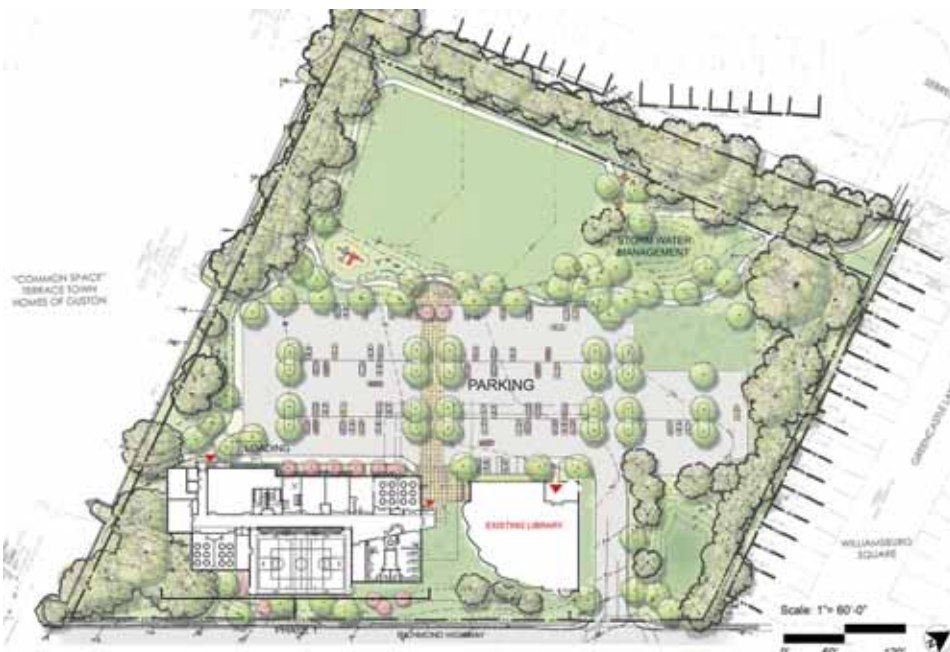
Lorton Community Center site.

We look forward to hearing from you and seeing you out and about in 2019! Finally, join us at the 32 nd Annual Town Meeting on Saturday, Feb. 2, 2019, from 7:45 a.m. – noon Mount Vernon HS to learn more about the year ahead and how you can get involved.