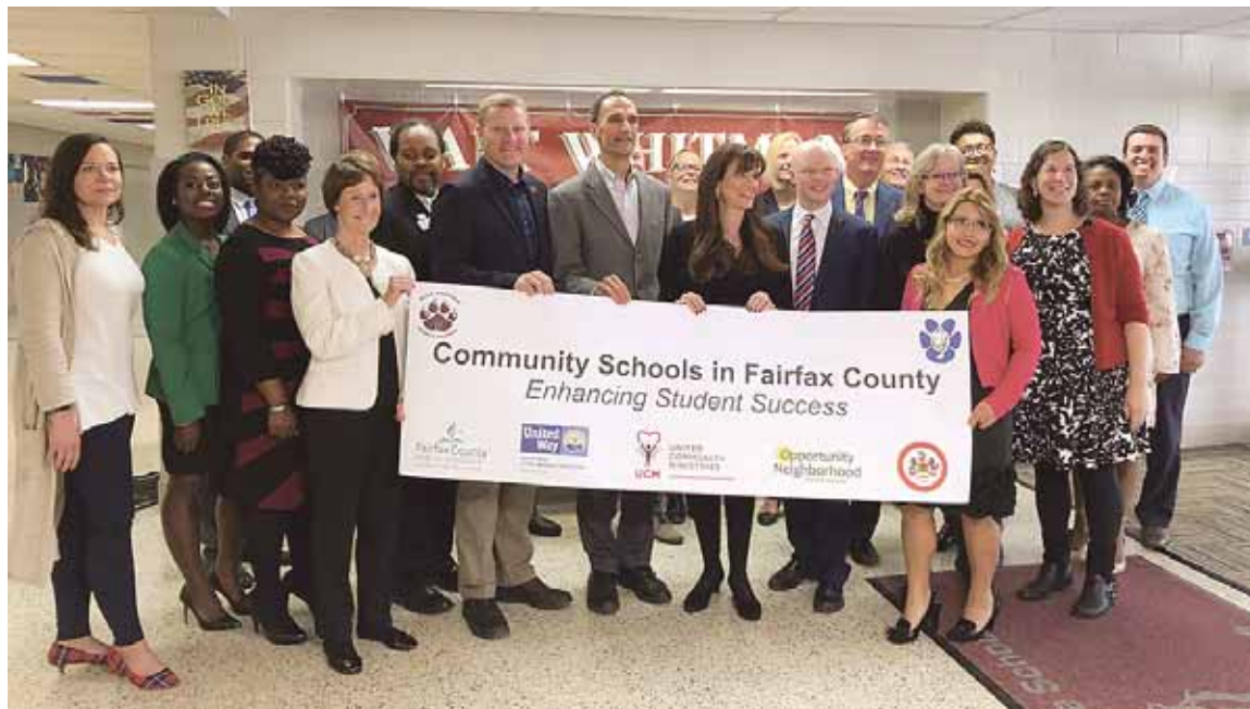
Community Schools: Among priorities - advocating for more state K-12 education spending for our students.

During my time as Supervisor, I have always made it my mission to revitalize the Route One Corridor. This year, we passed our years-in-the-making Embark Comprehensive Amendment Plan, a plan to revitalize the Route One