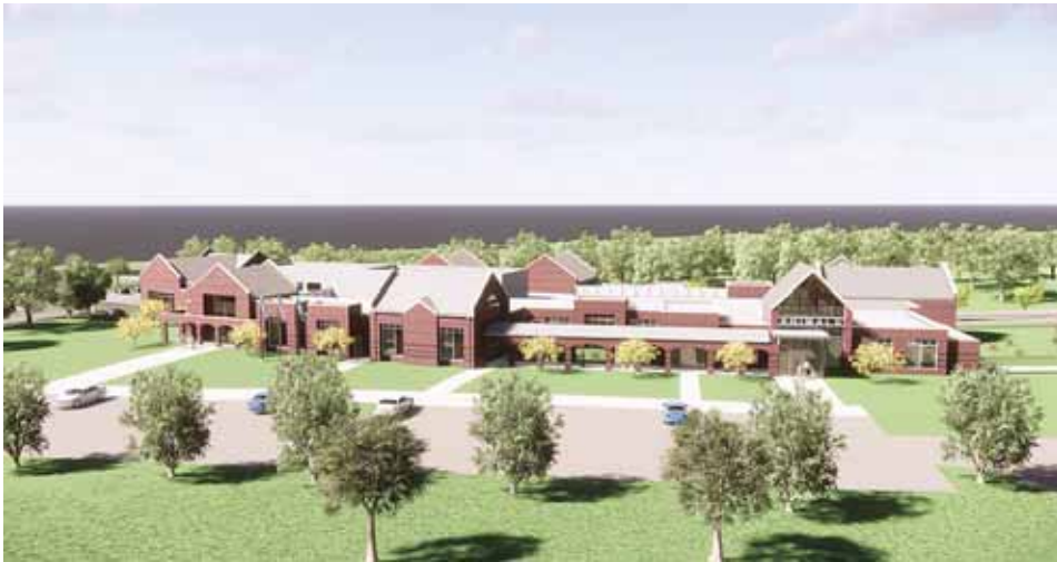
Renderings of South County Police Station & Animal Shelter.