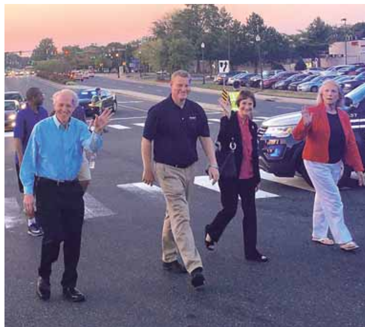
Annual Bridge Walk 2018: The event brings neighboring communities together.

I'm looking forward to continuing to strengthen the relationship between the Fairfax County Police Department and community through the implementation of reforms addressed in the Ad Hoc