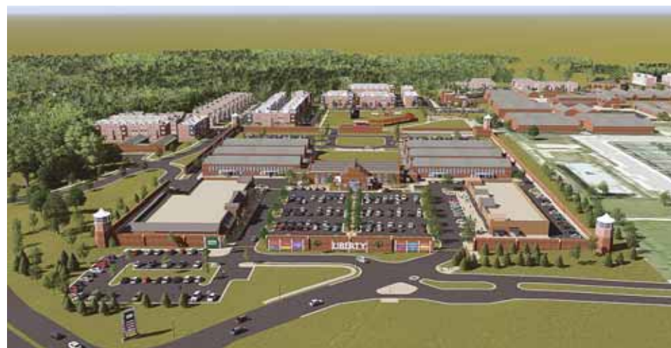
Lorton Liberty Phase 2.

Perhaps the most important 2019 development for the Lorton area will be the launch of the Lorton 2040 Visioning Task Force. The Task Force will work in conjunction with our office and County staff to craft