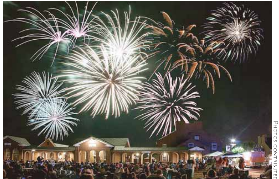
Workhouse Arts Center Fireworks.