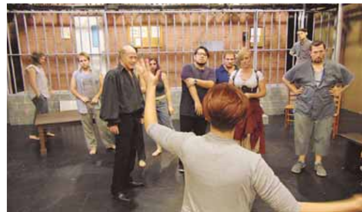
The cast of Workhouse Arts Center's "Man of La Mancha" gets some stage direction during rehearsals before a show.

For audience takeaways, he said: "I guess most of all I hope that they enjoy it and are entertained by it and moved by the profound humanity of the whole thing. I think we bring it across very well. It's a big show. It encompasses the whole heart — the human condi-