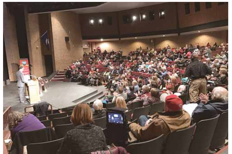
Town Hall Meeting.