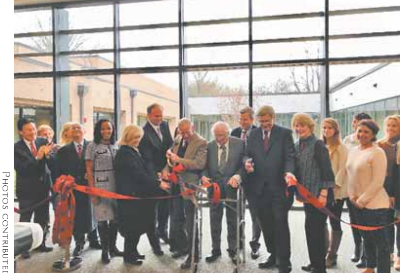
Work to renovate and expand the McLean Community Center wrapped up in late 2018 and a ribbon cutting was held on Dec. 5. The MCC is hosting Community Open House on Saturday, Jan. 5, 2019, 11 a.m.-2 p.m.