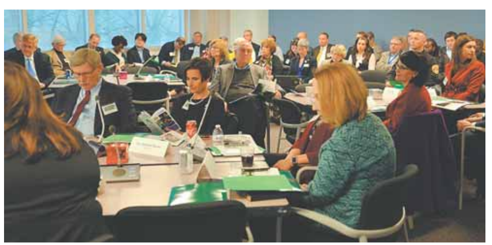
State delegates and senators joined the Fairfax County Board of Supervisors, other county staff, and representatives from a number of civic groups for a legislative work session prior to the start of the 2019 General Assembly in January.

Increased state funding for school divisions with high numbers of English learners, students living in economically disadvantaged households, students with special needs, and/ or requiring mental health services;