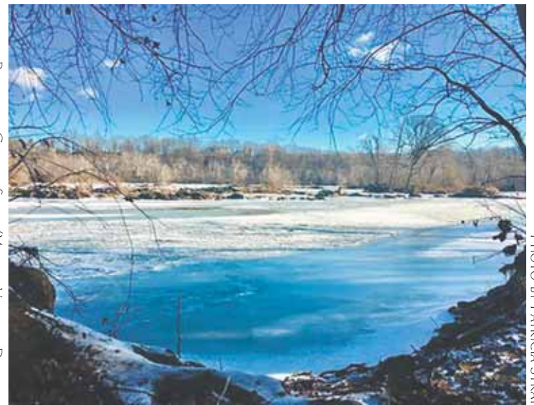
The winning photo from 2018 featured ice on the Potomac River.

In 2018 Patricia Strat's wintry photo of Riverbend Park was named the winner of the First Hike Fairfax Photo Contest. The frozen Potomac River was not to be found