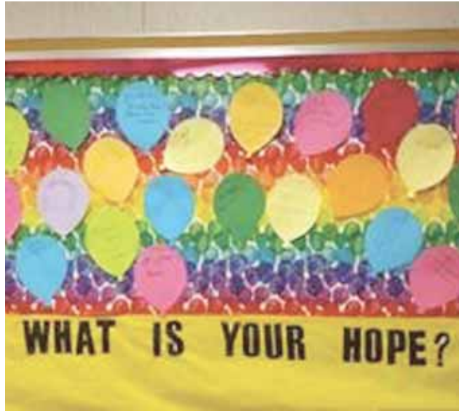
Bulletin board with "What is your hope" messages.

mental health and strategies they can use to help maintain positive mental health. Using funds from the grant, the students designed posters on that theme and a spe-