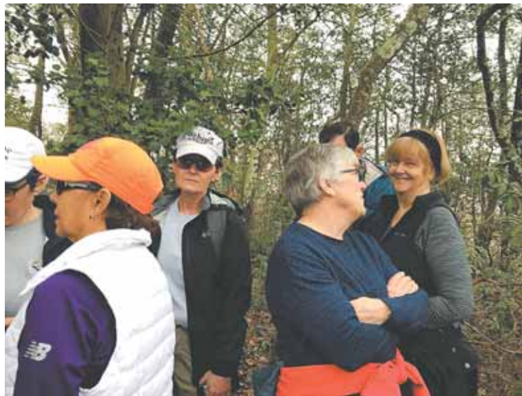
Out at Mason Neck, the Mount Vernon hikers gather on Jan. 1.

According to the county, the Fairfax County Park Authority joined with America's state parks and Virginia State Parks for First Day Hike Programs to encourage everyone to start 2019 with an outdoor hike. "This is the third year for First Hike Fairfax, which began in 2017," said