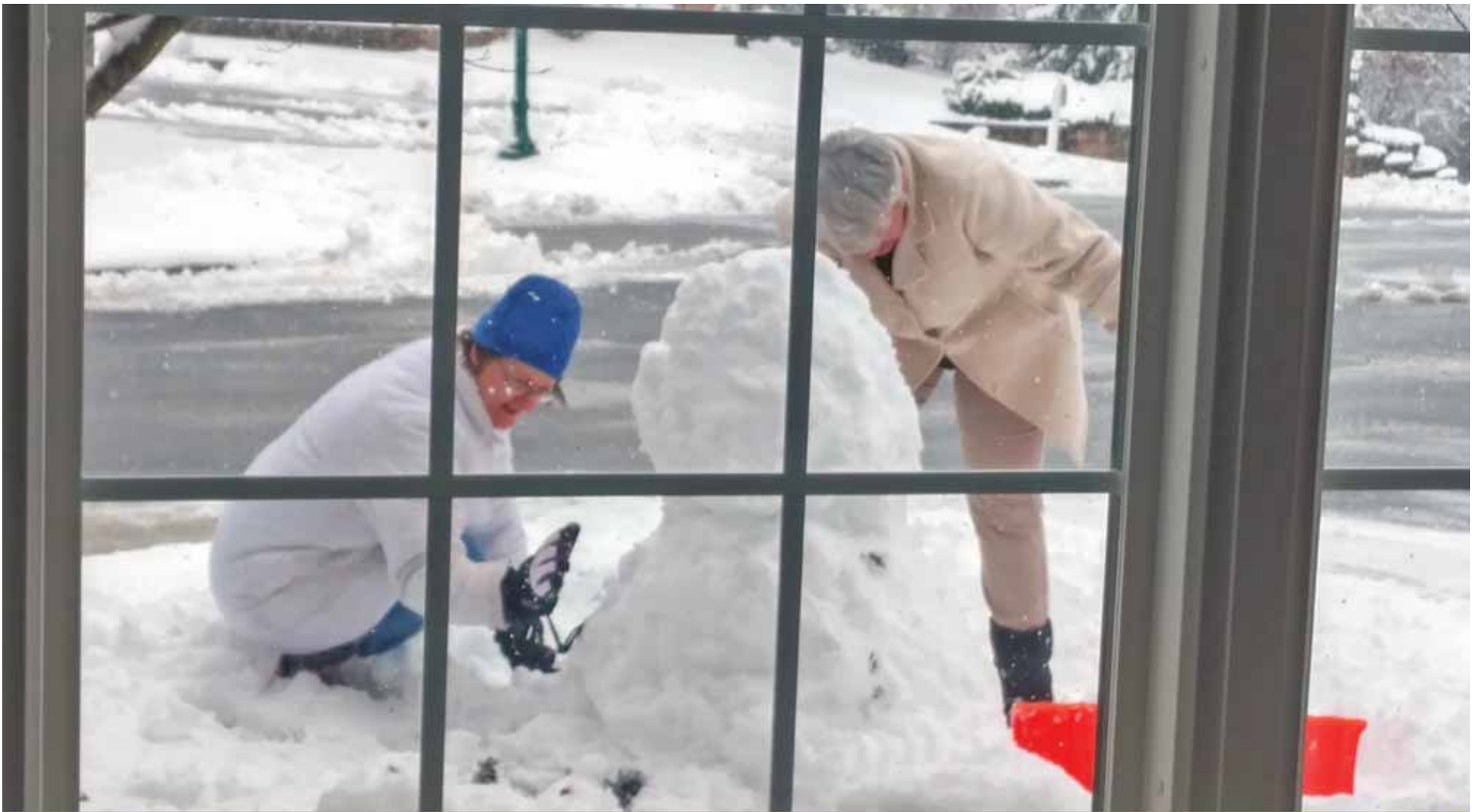
Brandywine resident since 2015