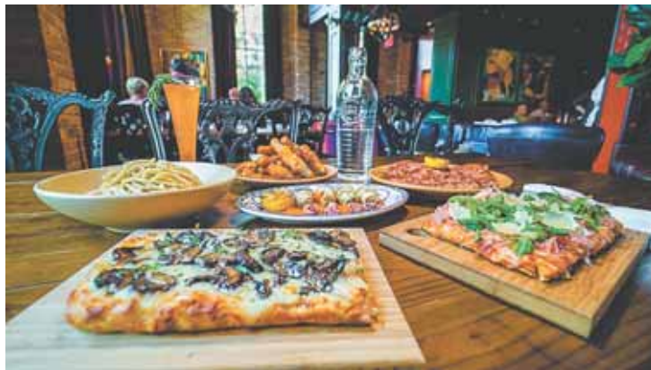
Mia's Italian Kitchen

For 10 days and two weekends (Jan. 18-27), 65 restaurants in Alexandria, Virginia, will offer a $35 three-course dinner for one or a $35 dinner for two. More than 35 restaurants will also offer lunch menus at $15 or $22 per person in addition to the dinner specials. Brunch lovers can enjoy brunch menus for $15 or $22 per person at 14 restaurants. Learn more about restaurant week at AlexandriaRestaurantWeek.com .