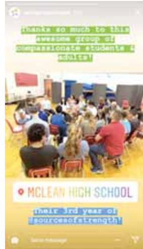
Social media post from McLean High School with a photo of participants in Sources of Strength.

❖ Mountain View Alternative Learning Center conducted a project titled "I'm MINDING My Health," where 24 students participated in 2-3 days of student-led group activities around the theme of mental health awareness. The group planned for and participated in group activities facilitated by the school's psychologist, social worker and counselor. They discussed definitions of