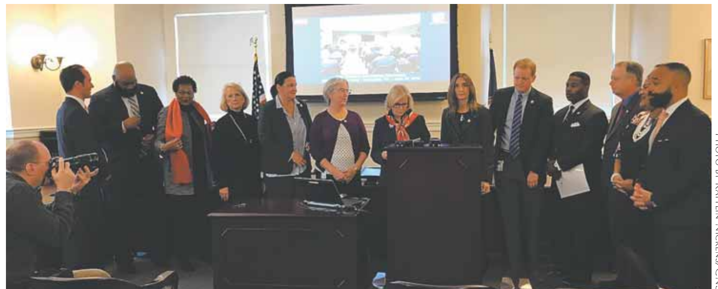
Democratic legislators meet to discuss school safety and gun violence.

"Numbers are heartbreaking ... I know this personally, having lost my own brother to gun violence," Murphy said, whose brother was murdered during a robbery.