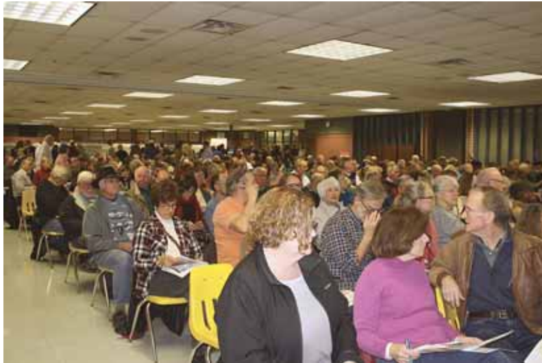
A packed house at Robinson Secondary.