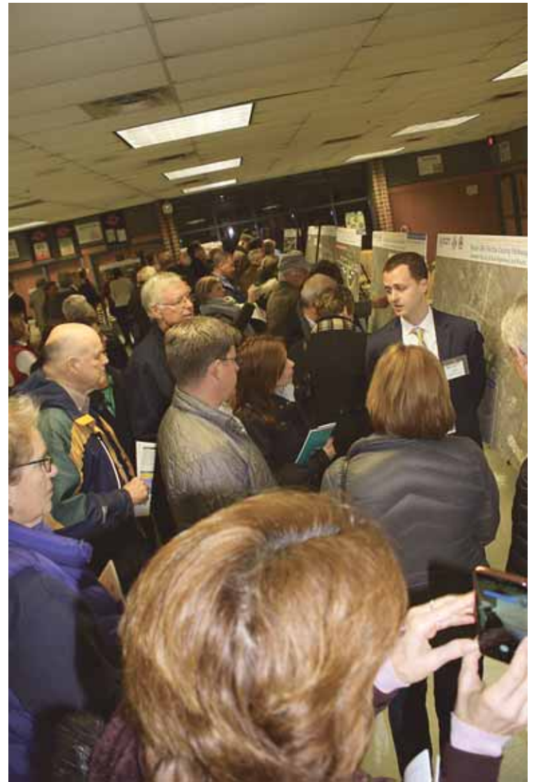
The updated project boards were available for viewing and discussion.

THE POPES HEAD ROAD interchange is part of Phase I, and will be built first with some of the funding already in place for this part. Construction could begin as early as 2020 and could be completed in 2022. The project is being financed with federal, state and local funds, including Smart Scale and Northern Virginia Transportation Authority funding. Comments will be accepted until Jan. 22.