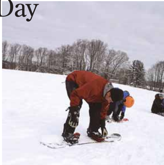
Snowboards are gaining in popularity on the hill.