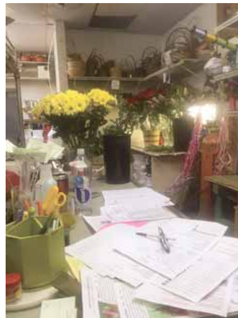
Paperwork starts to pile up.

Around Flowers 'n' Ferns, there is the stress factor for everyone in the family. "We