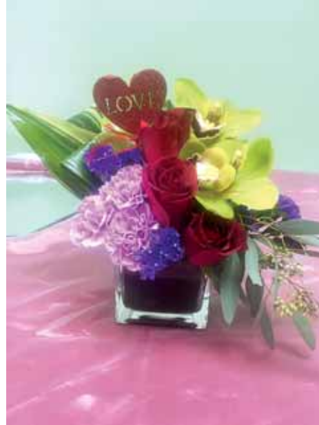
This arrangement is called "Mid-night Passion."