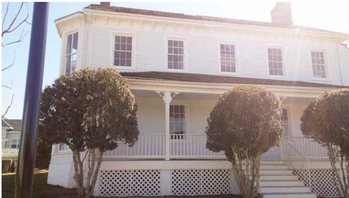
Woodbury aka Silas Burke House

Chinese Food Fest. Friday, 11 a.m.-7 p.m.; Saturday, 10 a.m.-5 p.m. at Wegmans Fairfax, 11620 Monument Drive, Fairfax. Attendees can taste Peking duck Wegmans-style, fresh