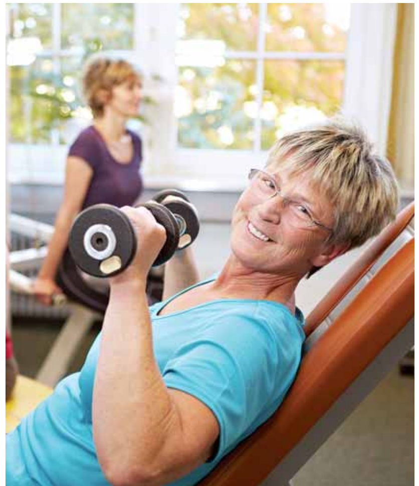
Strength-training exercises has the ability to increase muscles strength and mass and allows seniors to stay mobile longer.

In fact, David Schwartz, a personal trainer in