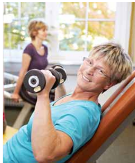
Strength-training exercises has the ability to increase muscles strength and mass and allows seniors to stay mobile longer.