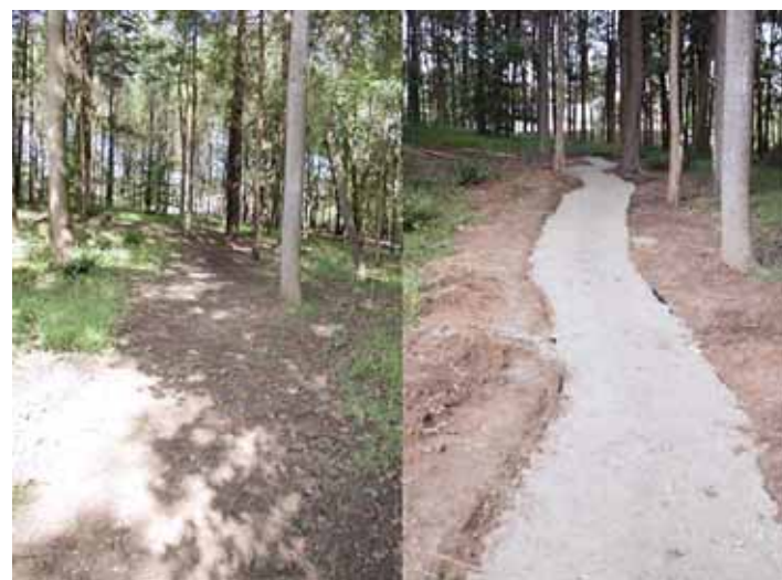
The nature trail's condition before and after completion of the work.