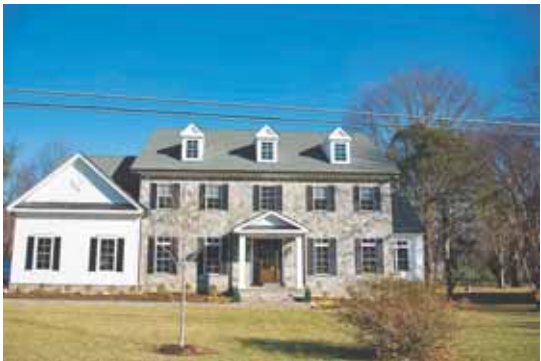
5 10331 Carol Street — $1,750,000