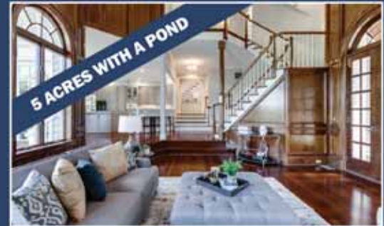
Great Falls $2,999,000