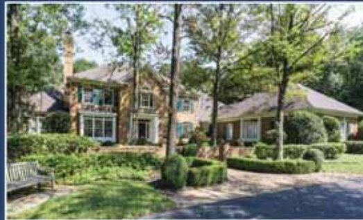
Great Falls $1,750,000