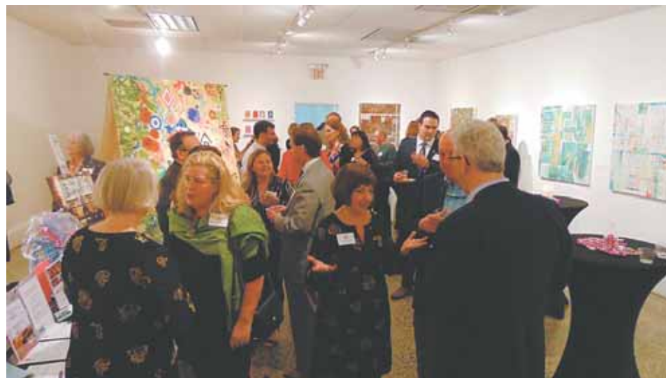
Guests mingle during the NDWC's Arts Night Out Gala.