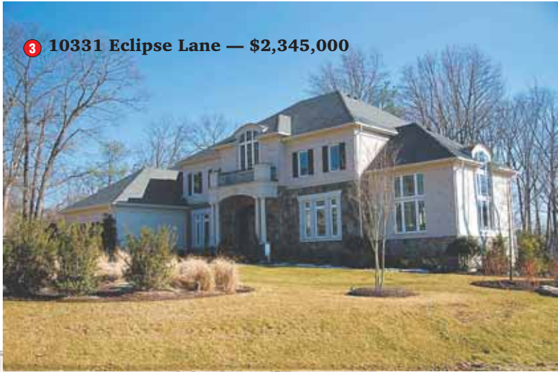
3 10331 Eclipse Lane — $2,345,000