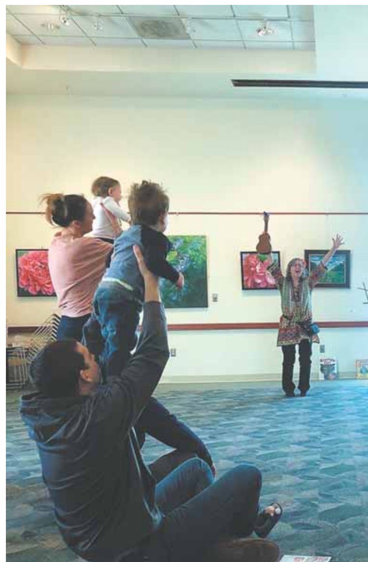
Members of the audience are lifted into the air in sync with the lyrics of the song "Zoom, Zoom, Zoom, We're Going to the Moon."