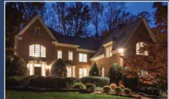
Great Falls $1,600,000