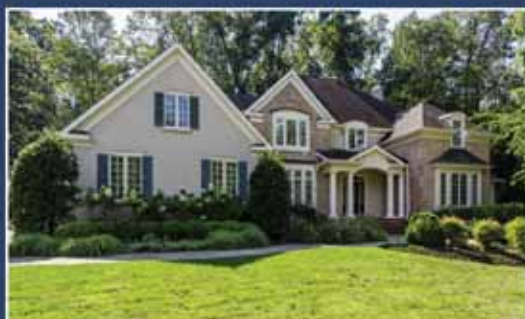
Great Falls $1,499,000