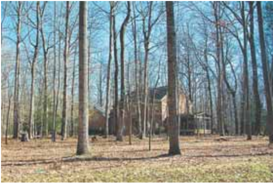
8 684 Springvale Road — $1,399,000