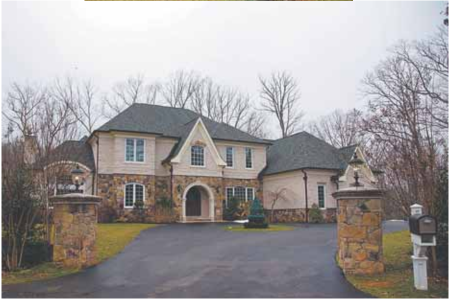
2 958 Carya Court — $2,825,000