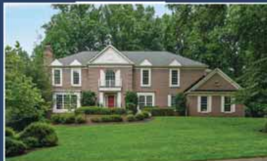
Great Falls $1,465,000