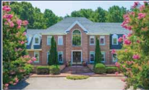
Great Falls $1,299,000

If you're buying or selling a home, think of this as a defining moment.