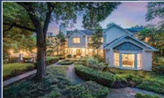
Great Falls $3,200,000