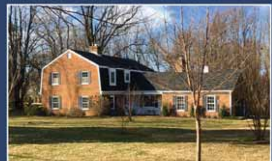
Great Falls $999,000