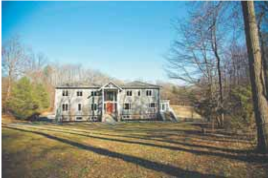
6 701 Clear Spring Road — $1,740,000

IN DECEMBER 2018, 20 GREAT FALLS HOMES SOLD BETWEEN $3,200,000-$615,000.