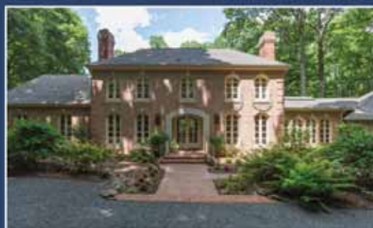
Great Falls $2,799,000