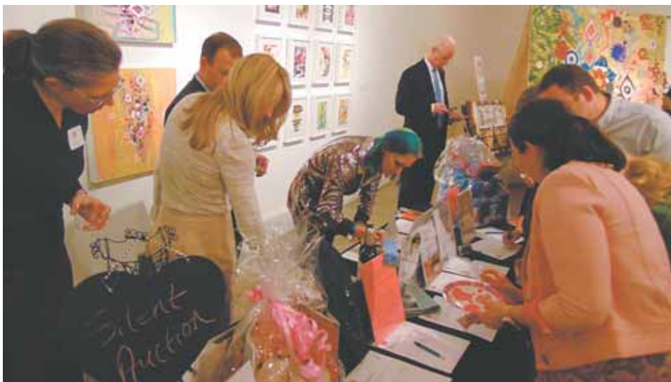
Guests peruse the Silent Auction items during the NDWC's Arts Night Out.