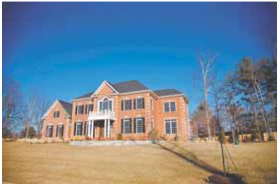
4 11191 Branton Lane — $1,750,000