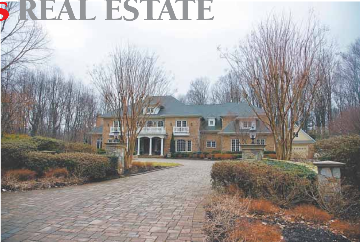
1 10411 Parkerhouse Drive — $3,200,000