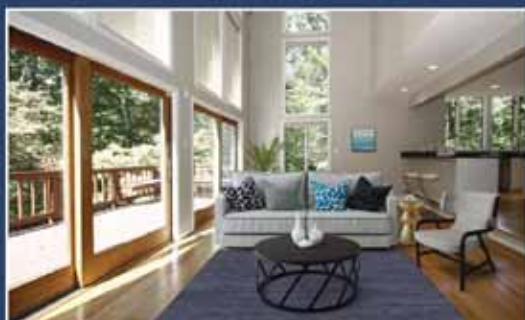
Great Falls $1,150,000