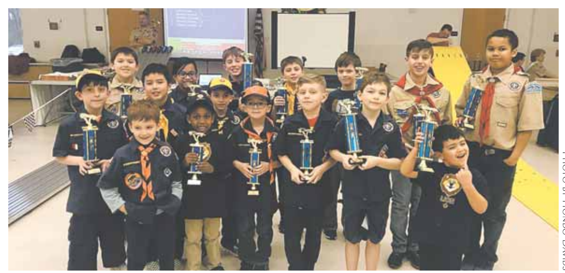
The first, second, and third place finishers of their respective ranks of the 2019 Sully District Pinewood Derby.

a record 42 entries. The categories were Cookies, Pies, Breads, Cakes, and Decorative / Creative. - Colin S., Pack 1459, Second Place Pack 1459.