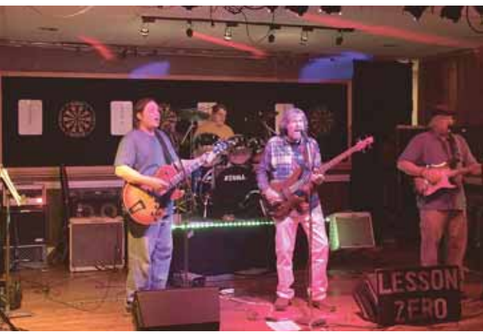
Live Music: Lesson Zero

The Mixing Bowl (formerly J W and Friends) presents live music with Lesson Zero. Saturday, March 30, 8 p.m.-midnight at The Mixing Bowl, 6531 Backlick Road, Springfield. Free. Visit www.jwandfriends.com for more.