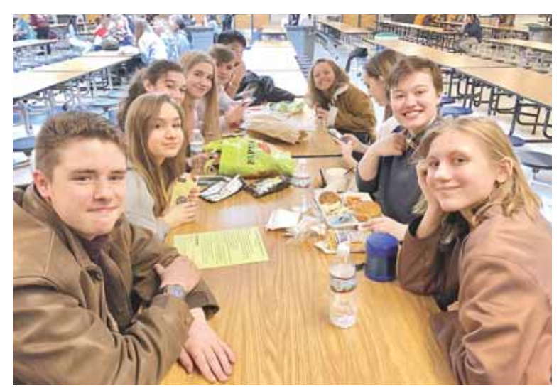
The school cafeteria provided an extra lunch period just for the Academy students during the Expo.