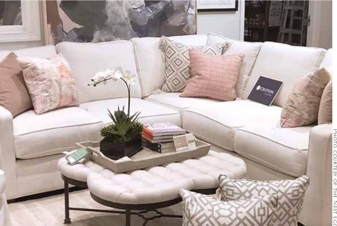
Pet owners should look for stain-resistant and durable upholstery fabrics when creating a stylish and animal-friendly interior.