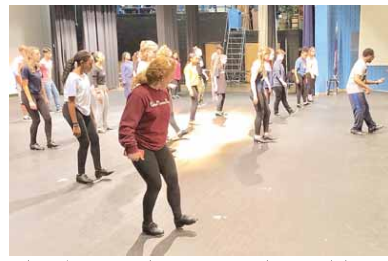
A dance instructor takes a master tap-dance workshop with the students,