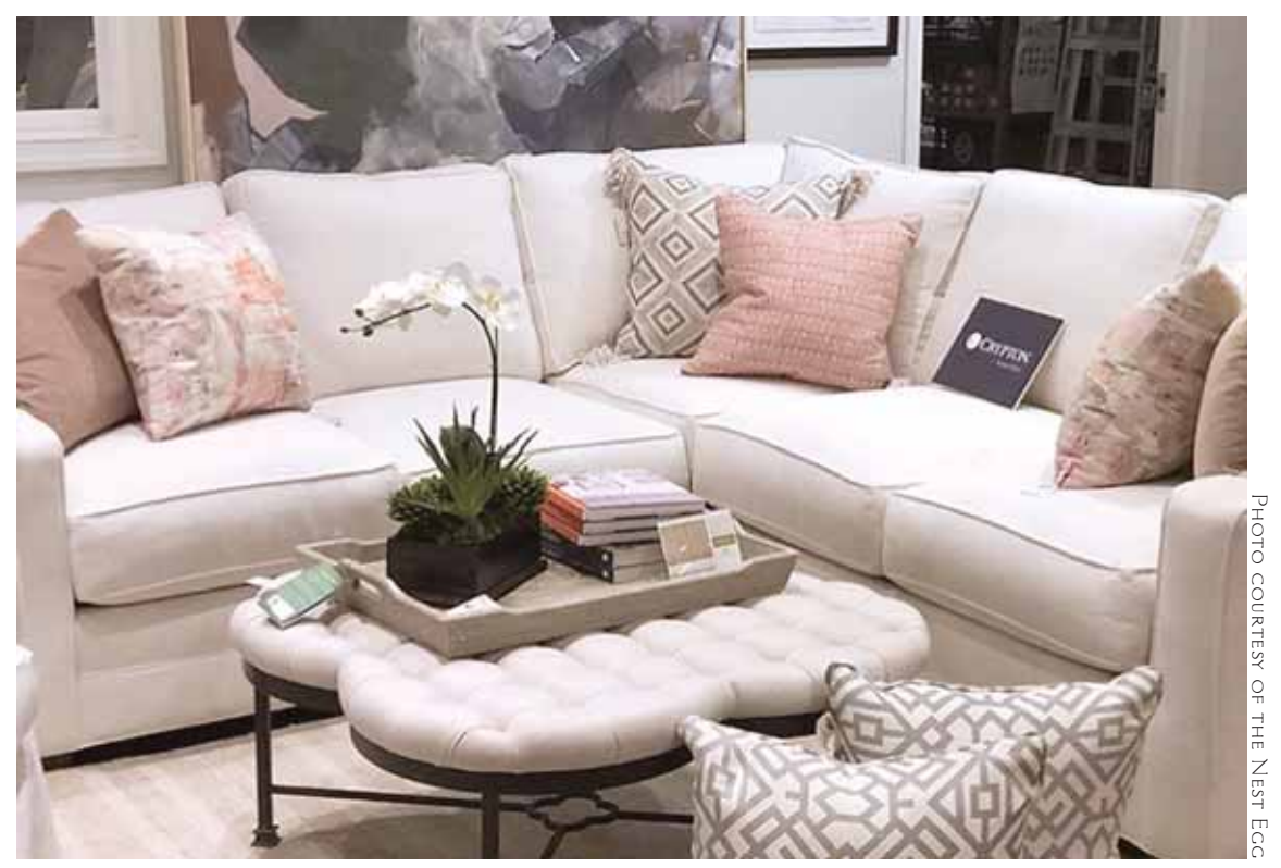
Pet owners should look for stain-resistant and durable upholstery fabrics when creating a stylish and animal-friendly interior.