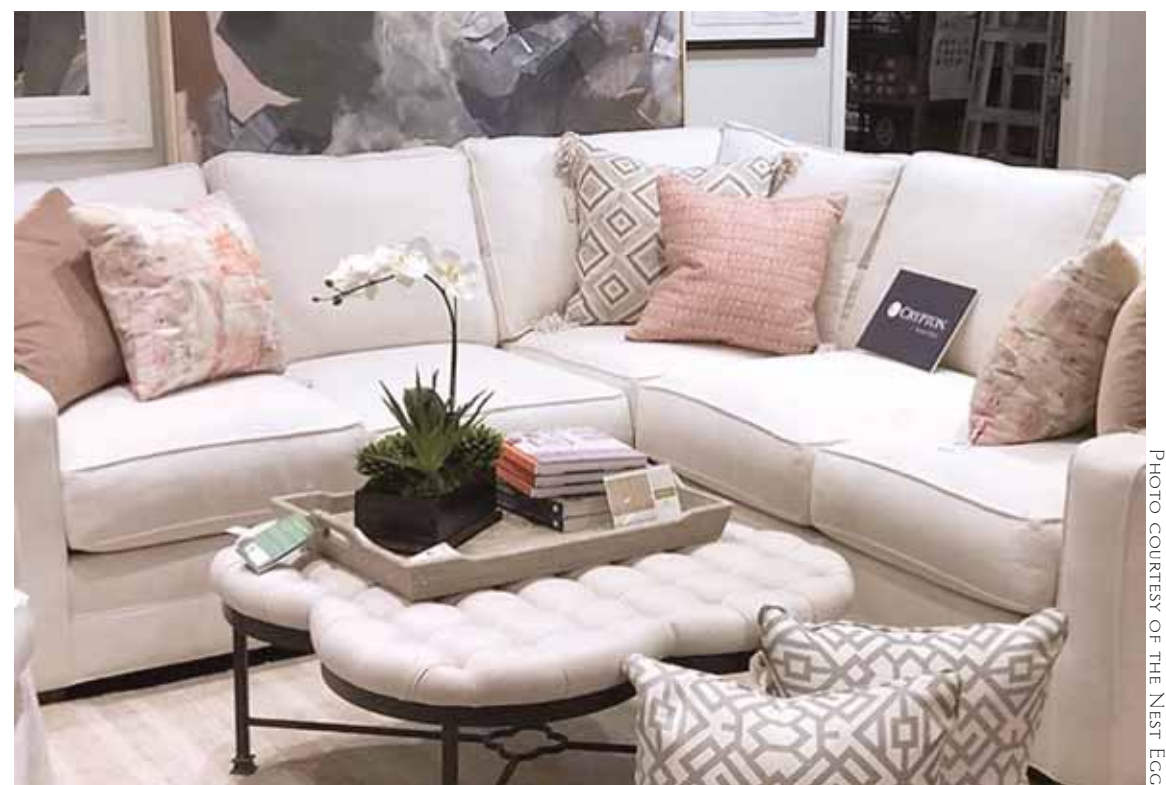
Pet owners should look for stain-resistant and durable upholstery fabrics when creating a stylish and animal-friendly interior.