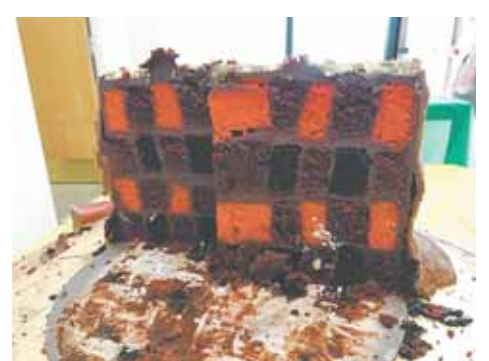
Inside of the cake.