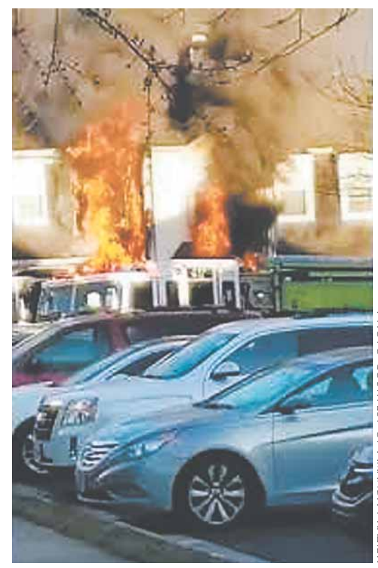
Damages as a result of the fire were approximately $322,000.

townhomes on either side. Firefighters were able to offered and accepted by 11 occupants. bring the fire under control. The occupant of the townhouse sustained non-life-threatening injuries