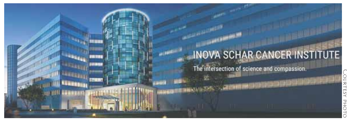
Schar Cancer Institute rendering.