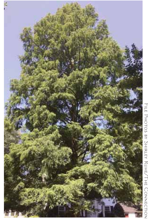
The 114-foot high dawn redwood tree on N. Ohio Street in May 2018.