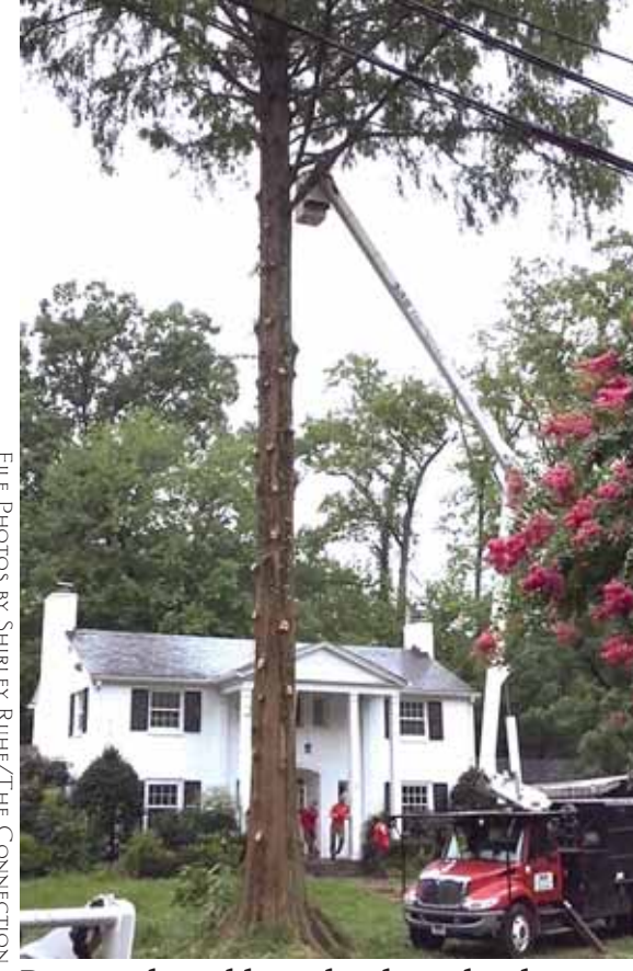
Dawn redwood loses battle to development in August 2018.