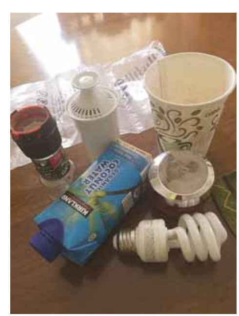
Do you know which of these items can go in your blue cart? Ask, if you aren't sure. Hint: not the Brita filter, but there are places to recycle that.