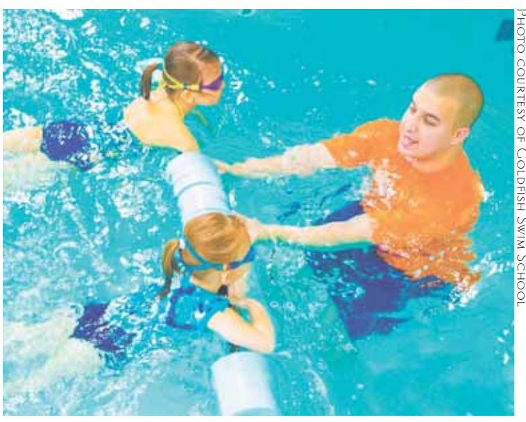
An instructor at Goldfish Swim School teaches young children how to swim. Lessons can help ensure water safety.

Another factor to consider is whether or not there is a lifeguard on duty who can watch those in the water at all times. Water quality should be another concern. "Smell to make sure there are no strong chemical smells, which is not a sign of proper chlori-