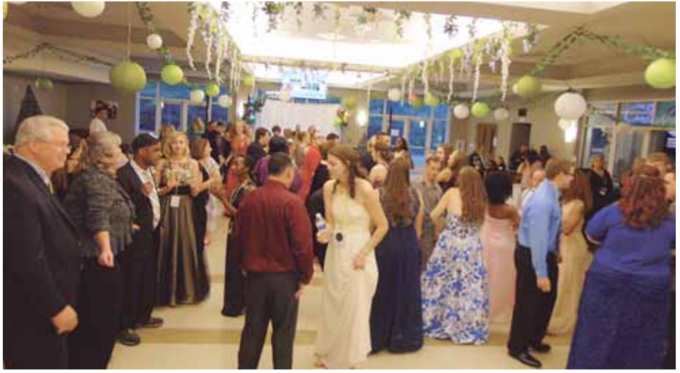
About 50 people with special needs participated in the Joy Prom Saturday at Centreville Baptist Church.