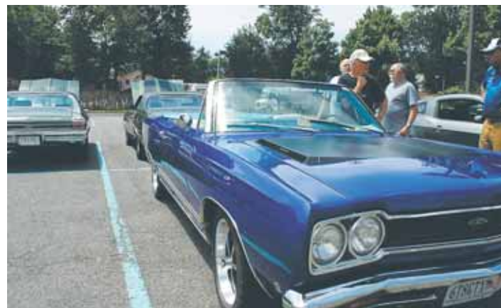
Cars on display kick off the Springfield Days weekend.

As part of the Virginia Department of Transportation's summer paving schedule, VDOT is paving the I-495 Outer Loop from just prior to Route 50 (mile marker 49.73) to the Springfield Interchange (stopping a little short of the bridge over I-395). It started back in November, stopped in mid-December for the winter, then resumed in early April. It's scheduled for completion in mid-August.