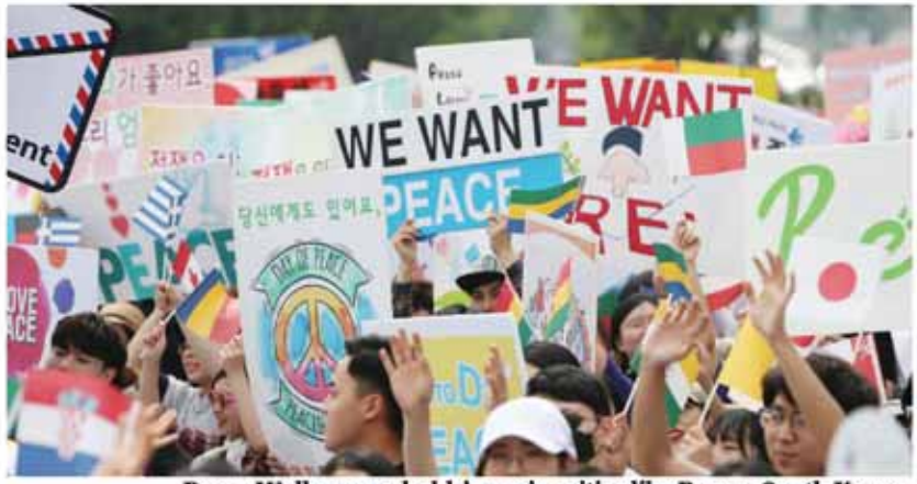
Peace Walks were held in major cities like Busan, South Korea

A diverse group of over 500 citizens from the D.C. metropolitan area and representing 21 countries walked for peace in conjunction with 52 other major cities including Boston and Atlanta. Volunteers from the D.C. Heavenly Culture, World Peace and Restoration of Light (HWPL) have also been working in various countries within the Caribbean such as Haiti, Belize, Guyana and Grenada to help host local peace walks in each respective country.