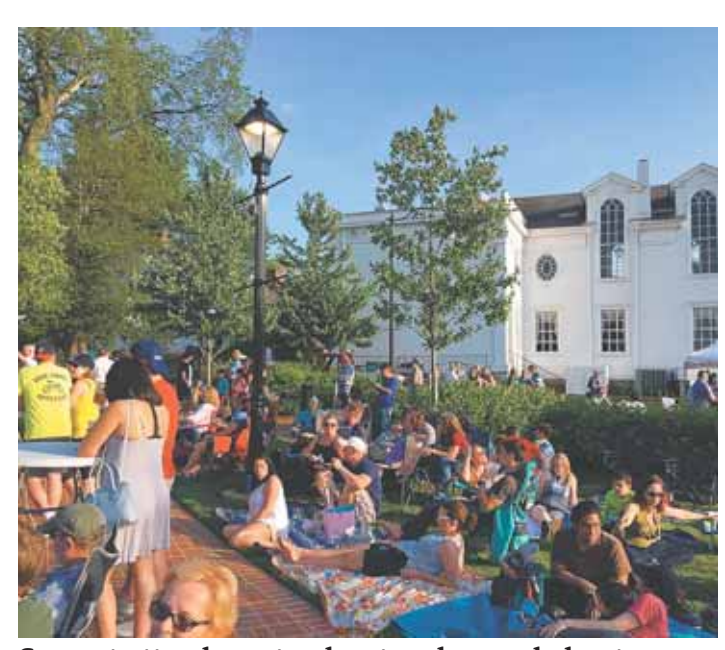
Concert attendees stood, sat and sprawled out on the lawn.