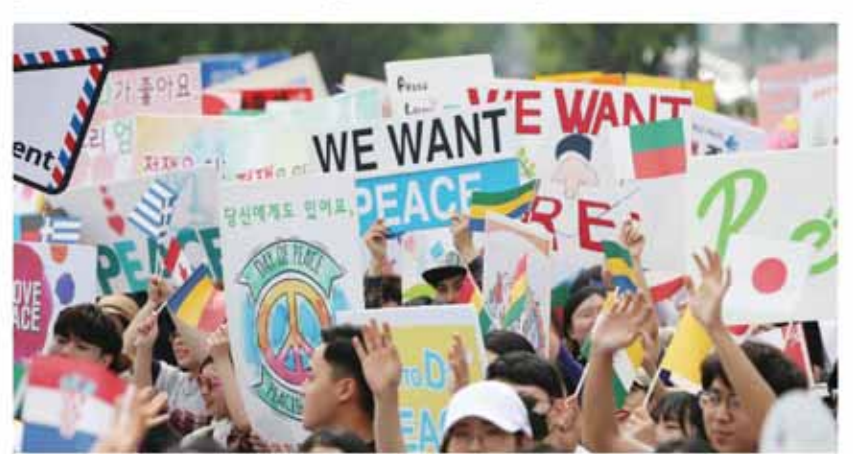
Peace Walks were held in major cities like Busan, South Korea

A diverse group of over 500 citizens from the D.C. metropolitan area and representing 21 countries walked for peace in conjunction with 52 other major cities including Boston and Atlanta. Volunteers from the D.C. Heavenly Culture, World Peace and Restoration of Light (HWPL) have also been working in various countries within the Caribbean such as Haiti, Belize, Guyana and Grenada to help host local peace walks in each respective country.