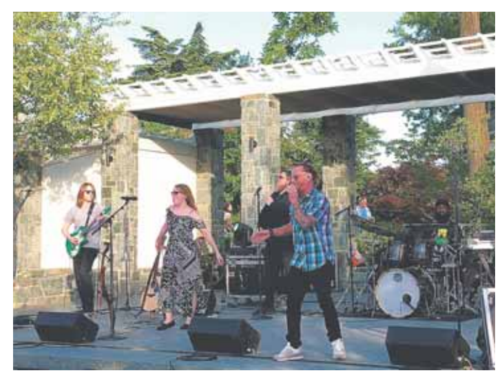
The Rockets had the crowd singing and dancing.

ood trucks, ice cream, beer, live music by the Rockets, good friends and a warm, spring night – who could ask for more? The first Rock the Block of the Season in Fairfax City was Friday night, May 24, in Old Town Square. The Rockets performed covers of past and current hit songs, and members of the huge crowd sang along to their favorites.