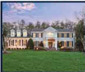
Briarlyn Estates Fairfax Station - $1,250,000