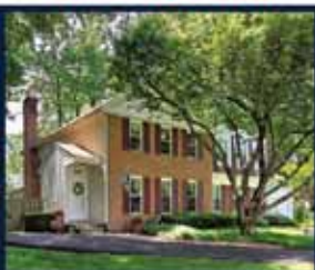
Burke Centre Burke - $519,000