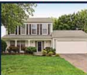
Woodstone Alexandria - $569,900