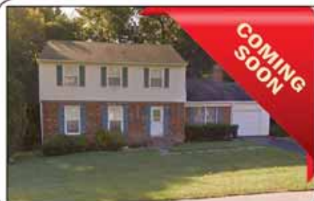
Fairfax - $590,000

Coming Soon - Put your personal touches on this Middleridge Payne Colonial. Currently undergoing new paint, new flooring, new garage door, new driveway and more. 5 Bedrooms and 2.5 Baths and finished walk-out basement, vinyl windows. Great cul-de-sac location, walk to Woodglan Lake, Middleridge Park, community pool and more. Easy commute to shopping and more.