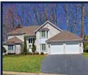
The Retreat at Crosspointe Lorton - $800,000