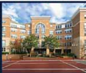
Savoy at Reston Town Center Reston - $415,000