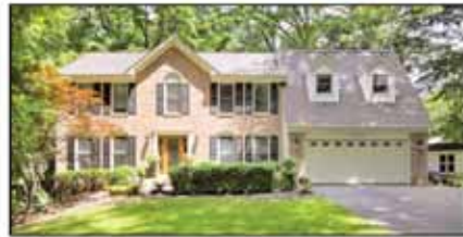
Fairfax Station - $899,000

Great Townhome in Great Community! This house has so many updates! Kitchen, all baths, flooring, landscaping, just to name a few!