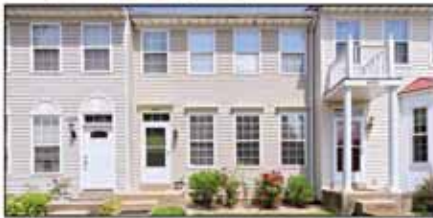
Centreville - $415,000

Hermendorfer Associates Top 1% of Agents Nationally