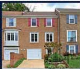
Rhygate West Springfield - $515,000