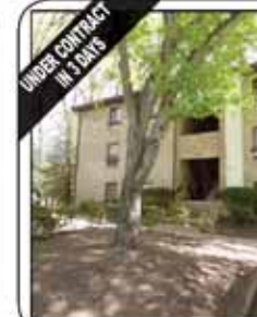
Reston Condo $190,000

W. Springfield $475,000 Stunning 5-1/2 all-brick tucked away in back of neighborhood on non-thru street backing to woods. Updates galore. New carpet, fresh paint. Spacious LR w/volume ceiling. Separate DR. Updated eat-in KT w/new LG Hi-Macs counters, updated appliances, new flooring & doors to deck overlooking wooded parkland. Master bedroom has WI closet plus remodeled bathroom with lg. walk-in shower & level. Walkout RR w/gas frpl & full bath. Great storage in unfinished bmt. 2 assigned parking spots + ample guest spaces. Call Jim for a tour today!