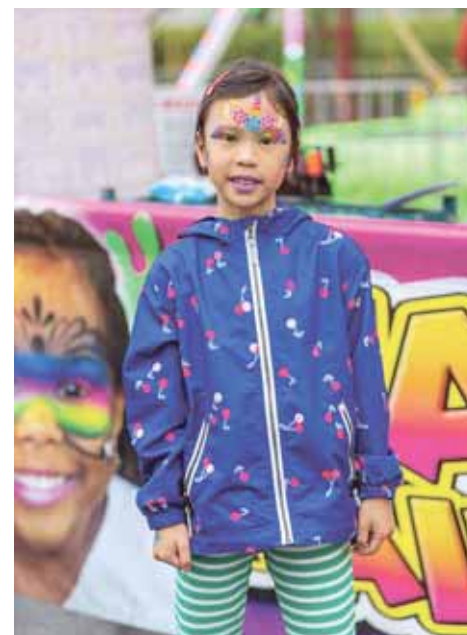
Mali, 7, from Vienna shows off her face paint.

tivities for the whole family including carnival rides and games, local vendors, and performances from rock bands Better Than Ezra and Smash Mouth.