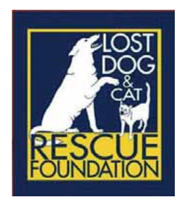
Helping Animals Find Their Way Since 2001

lost (adj): 1. unable to find the way. 2. not appreciated or understood. 3. no longer owned or known