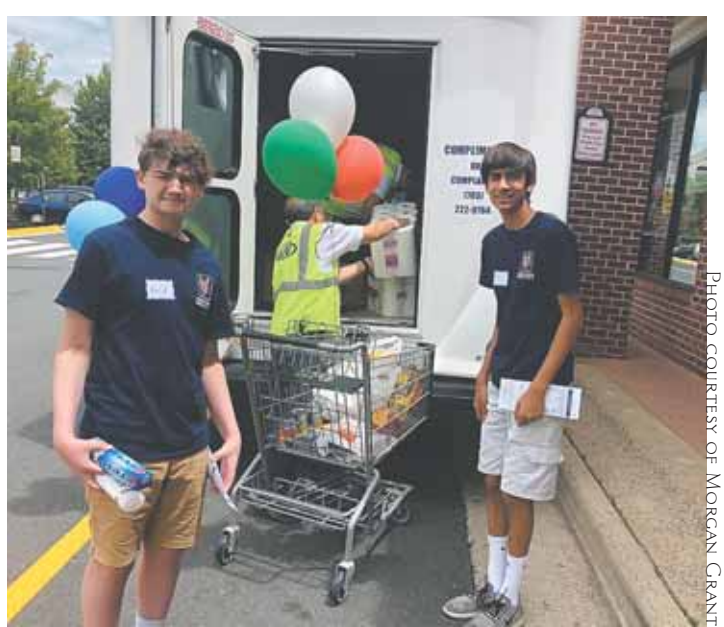
Volunteers stuff the bus with donations from shoppers.