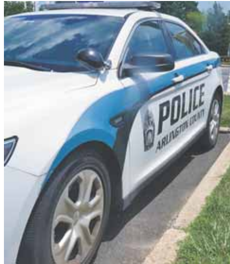
ACPD patrol car

Another resident commented he wanted to feel he lived in a neighborhood where