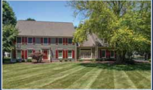
A = 11.