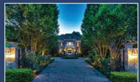
Great Falls $3,499,000