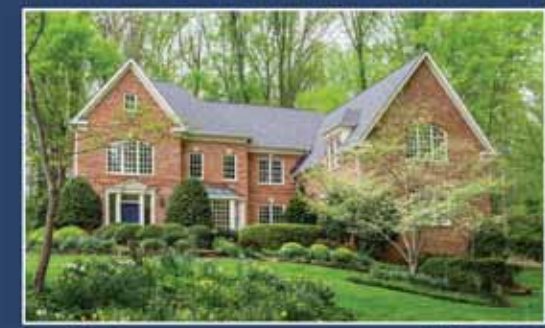
t Falls $1,499,00