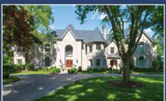
reat Falls $3,699,000