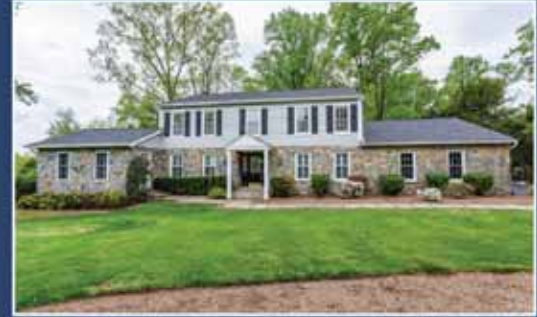
Great Falls $1,140,000