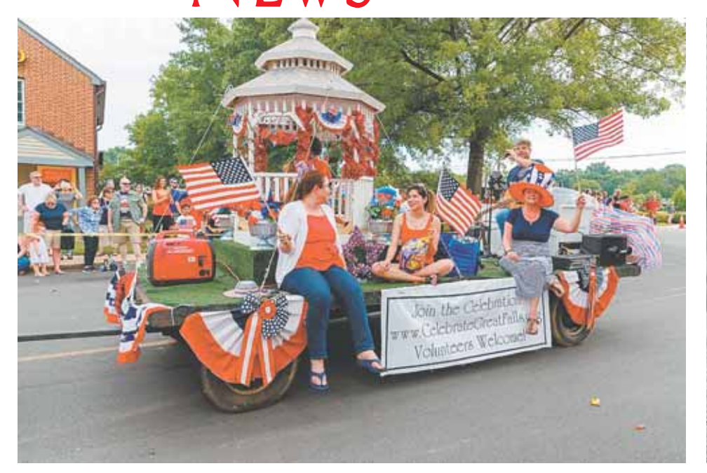
The Celebrate Great Falls float makes its way around the Village Green.