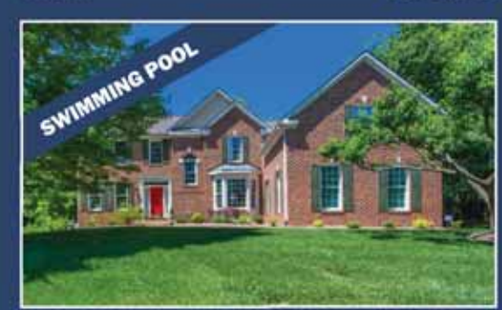
eat Falls $1,299,000