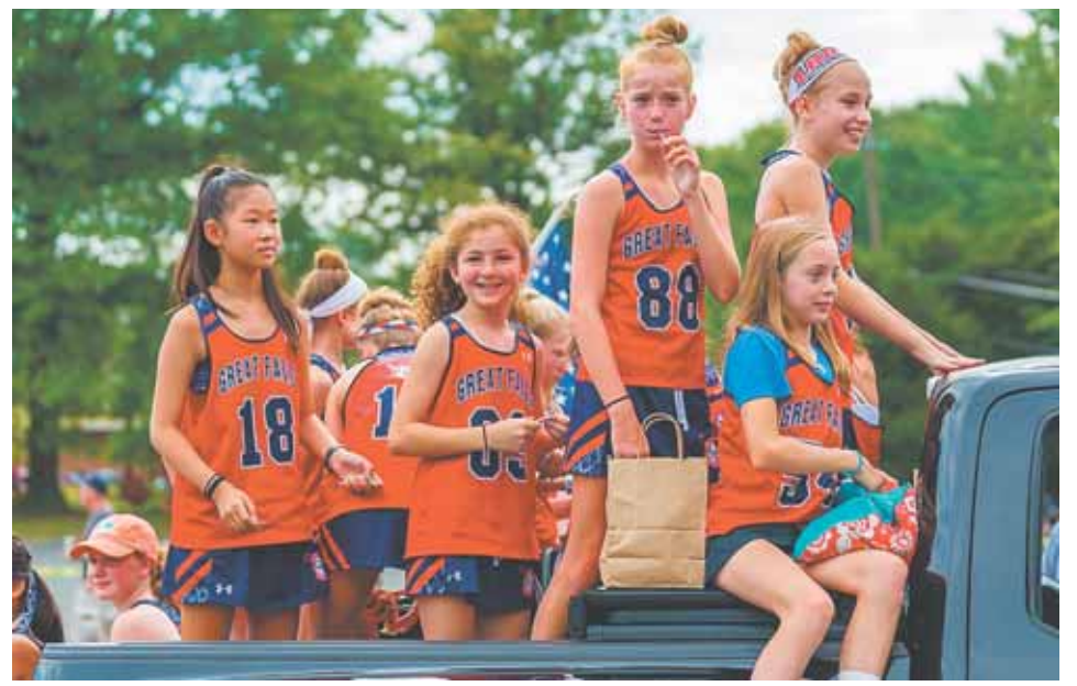
The parade featured members of Great Falls girls lacrosse.