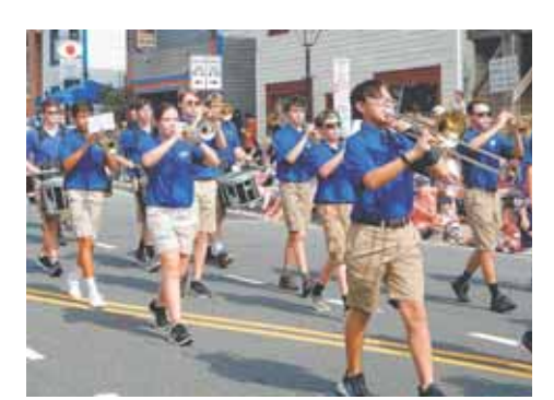
The Fairfax High Marching Band.