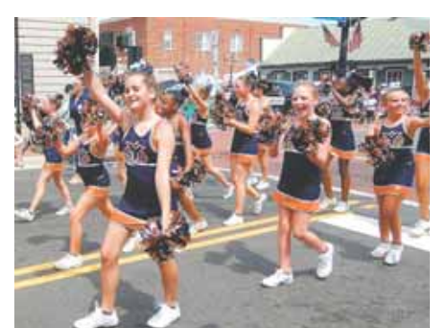
SYC All Stars show their spirit.