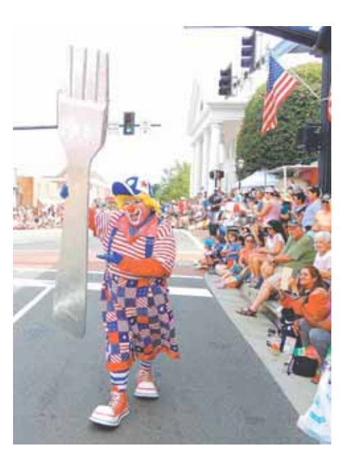
Could this clown be looking for food?