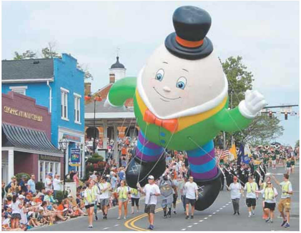
Humpty Dumpty makes his way down Main Street.