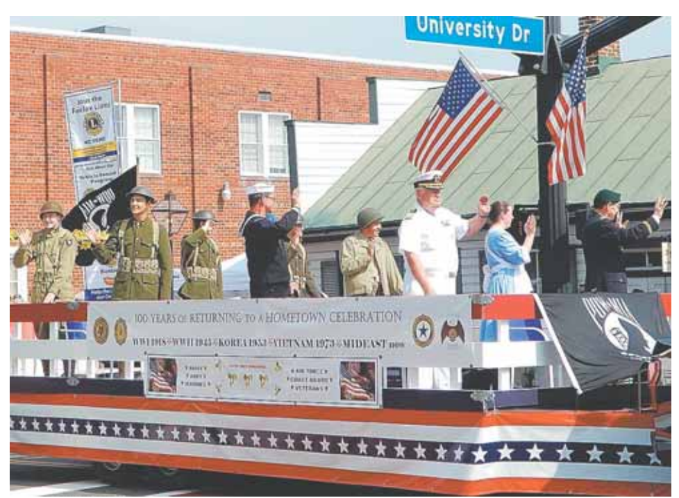
This float honors America's veterans.