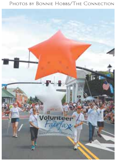
Volunteer Fairfax and red-andwhite star balloons.