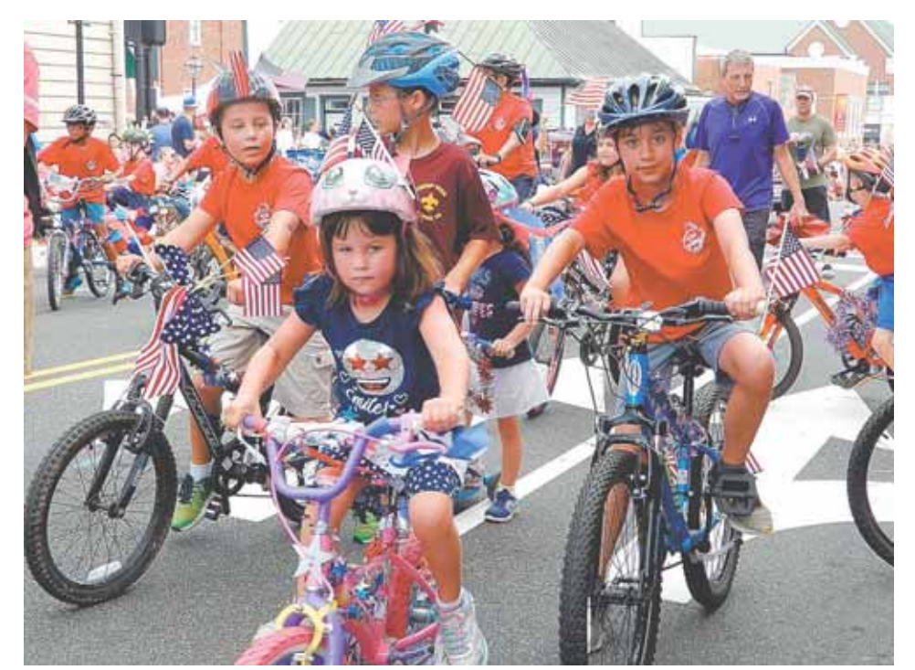
Young bicyclists brave the 90-degree heat.