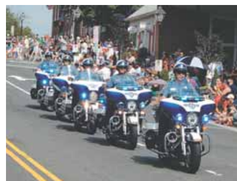
Fairfax City Police motorcycle officers lead the parade.