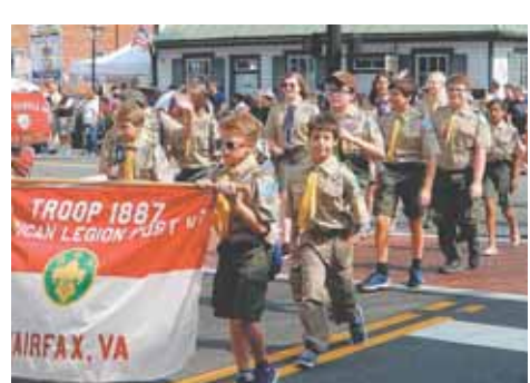
Boy Scout Troop 1887