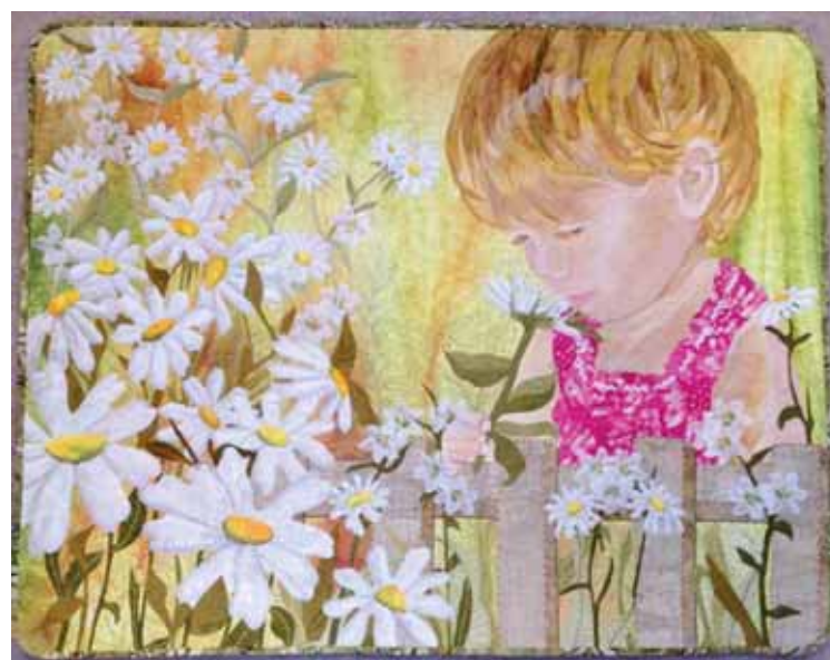
Barbara Hollinger's quilt was inspired by a photo of her granddaughter, Irene.

NTRAK Model Train Show. 1-4 p.m. at the Fairfax Station Railroad Museum, 11200 Fairfax Station Road, Fairfax Station. The Northern Virginia NTRAK members will hold a N gauge Train Display. Ages 16 and older, $4; 5-15, $2; 4 and under,